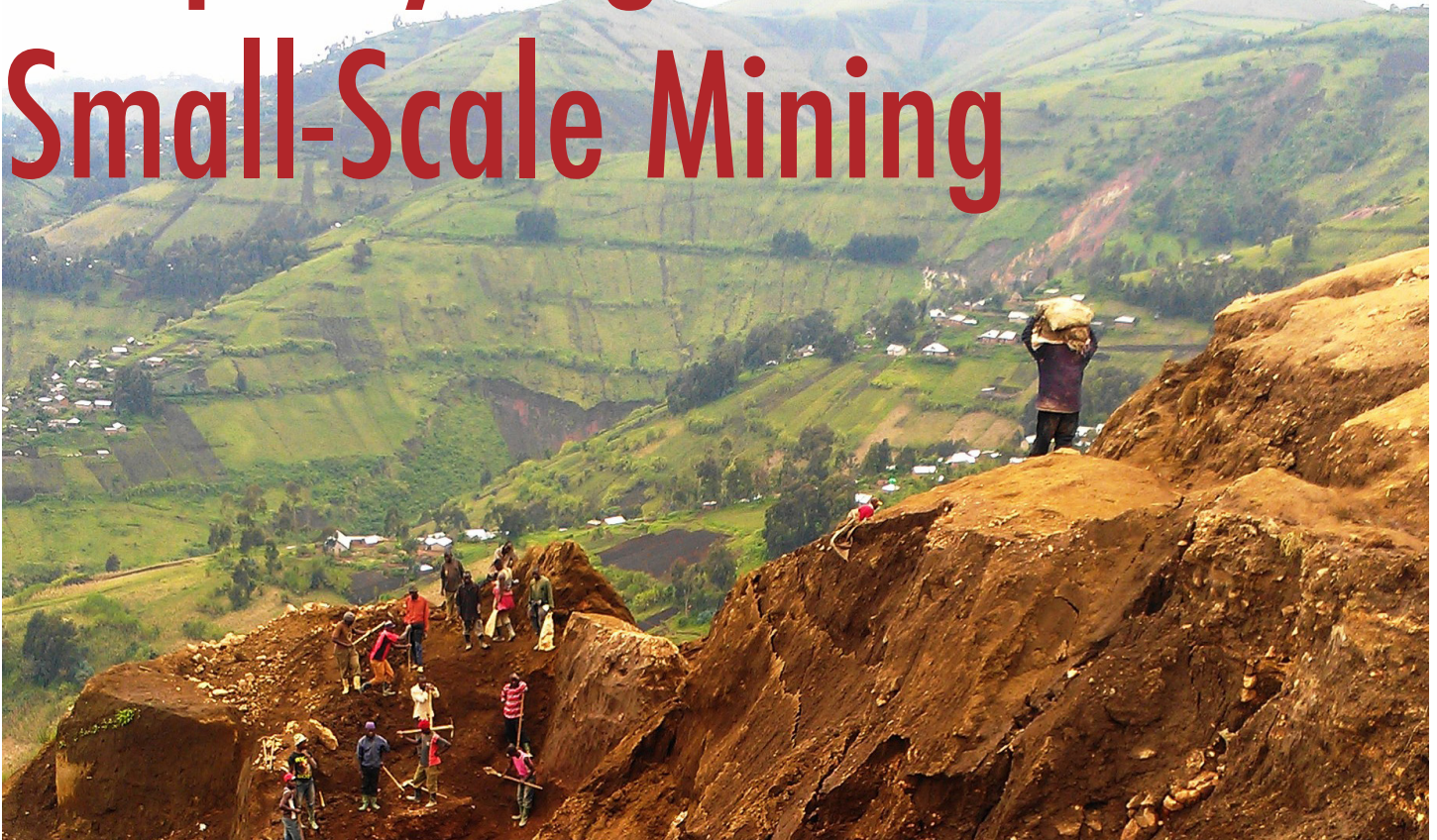
Photo: A coltan mine in North Kivu, Eastern Congo