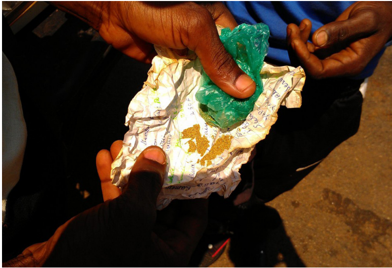
Photo: Gold mined through artisanal means, in Central African Republic

The articles in this Third World Thematics col-