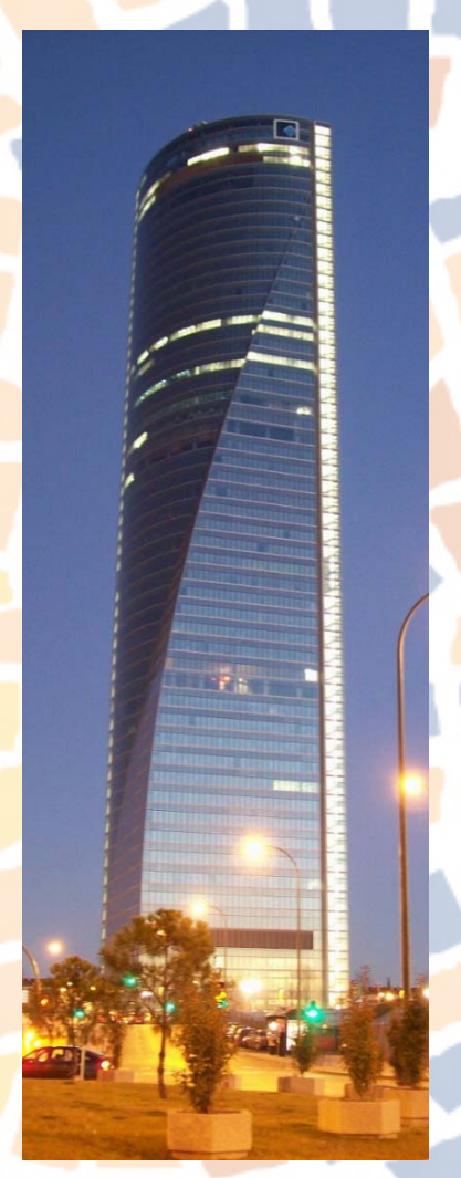
Espacio Tower, Madrid Main offices OHL Group