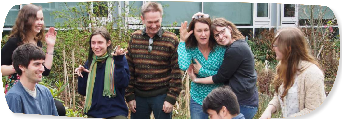
Community Mapping workshop with UVic students

The Community Institute for Engagement and Action (held in 2012–2013) produced a report and resource guide focused on capacity building for creative and asset-based neighborhoods, sustainability and community development. It features stories from throughout the CRD and helpful links and resources. The report was based on an eight-month capacity building program offered by the OCBR (and now by ISICUE) and the United Way of Greater Victoria. Download the report from the ISICUE website.