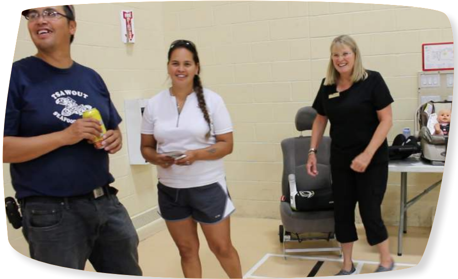
Community members attend transportation safety workshop at Tsawout.