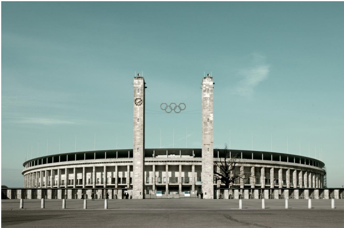
East Gate, 1936 Olympic Stadium, Berlin 2010