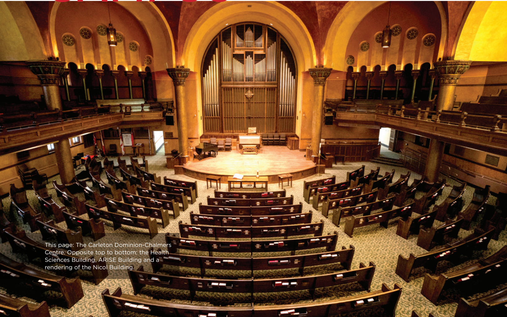
This page: The Carleton Dominion-Chalmers Centre. Opposite top to bottom: the Health Sciences Building, ARISE Building and a rendering of the Nicol Building.