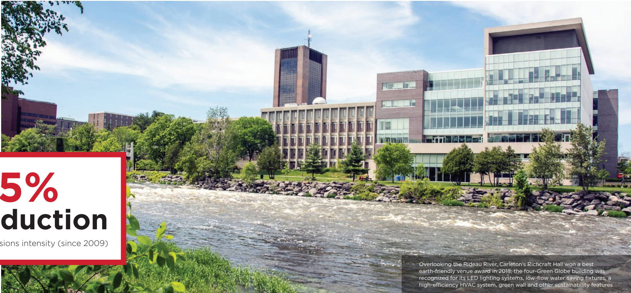
Overlooking the Rideau River, Carleton's Richcraft Hall won a best earth-friendly venue award in 2018; the four-Green Globe building was recognized for its LED lighting systems, low-flow water saving fixtures, a high-efficiency HVAC system, green wall and other sustainability features