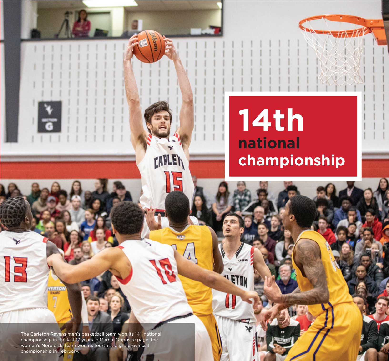
The Carleton Ravens men’s basketball team won its 14 th national championship in the last 17 years in March. Opposite page: the women’s Nordic ski team won its fourth straight provincial championship in February.

Other athletic highlights include the men’s curling team winning its first U SPORTS gold medal in March and the women’s Nordic ski team winning the OUA Championship in February, its fourth consecutive title.