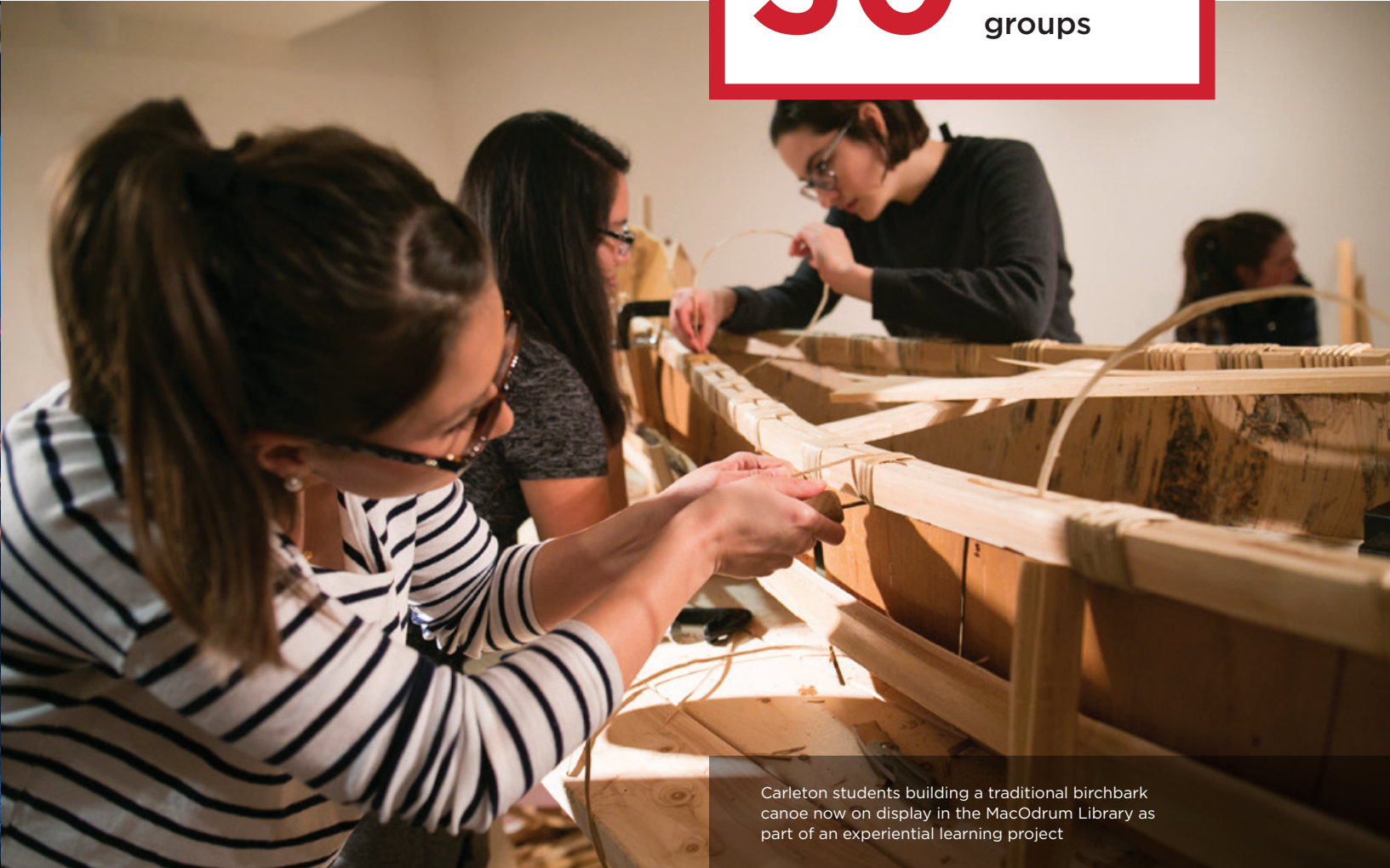
Carleton students building a traditional birchbark canoe now on display in the MacOdrum Library as part of an experiential learning project