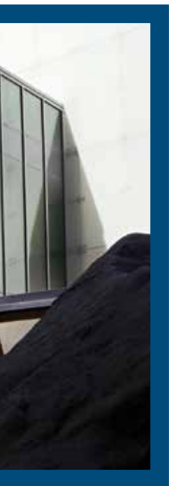
Photo: Ryerson Centre façade.

projects, which involve the collaboration of local indigenous communities. An example is the Whyte Museum of the Rockies' "Recognizing Relations" collaboration with the ȩyāǰé Nakoda people.