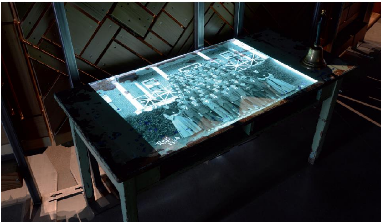
Fig. 6: One of the group photos taken from the residential school. (Newman and Hudson, Picking Up the Pieces , p. 94).