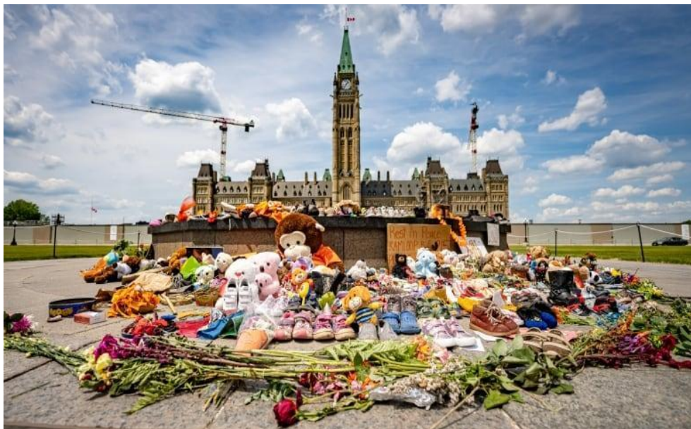
Fig. 2: The memorial placed around the Centennial Flame, 2021, Shoes, stuffed toys and other items, Parliament Hill, Ottawa, Ontario

https://www.theartnewspaper.com/2021/06/04/haida-artist-tamara-bell-installs-215-shoes-on-the-steps-of-vancouver-art-gallery-as-a-memorial-to-indigenous-children-who-died-at-residential-school