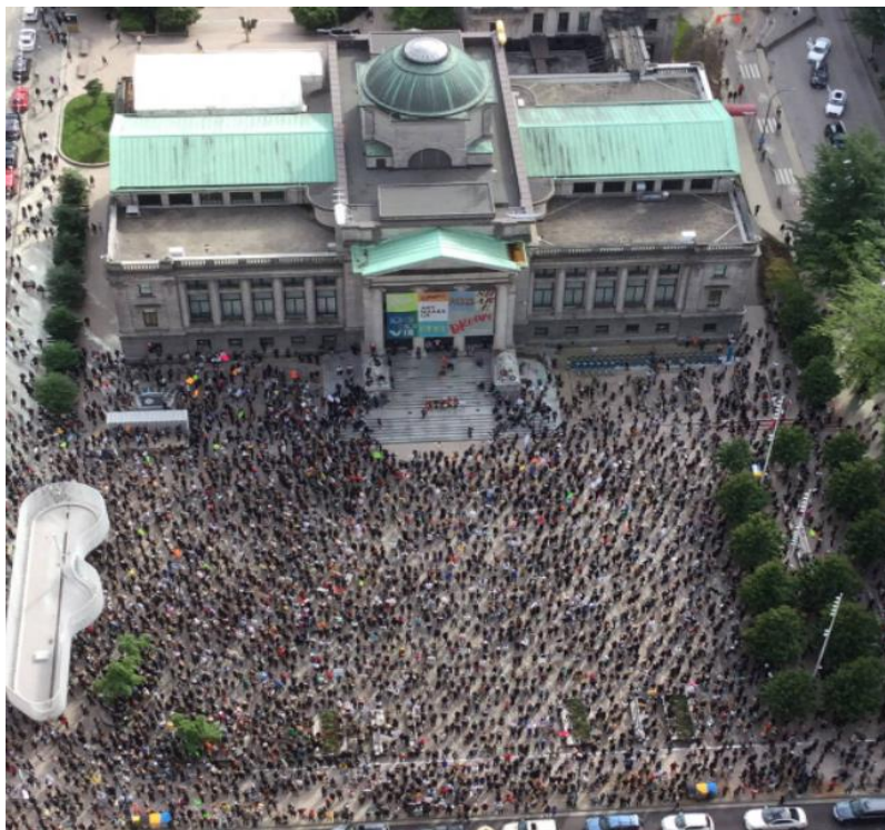
Fig. 8: The Black Lives Matter Movement in front of the Vancouver Art Gallery, May 31, 2020, video, Vancouver, B.C., twitter by Marguerite Ethier.

https://www.vicnews.com/news/protectors-prepare-to-rally-against-racism-in-front-of-vancouver-art-gallery/