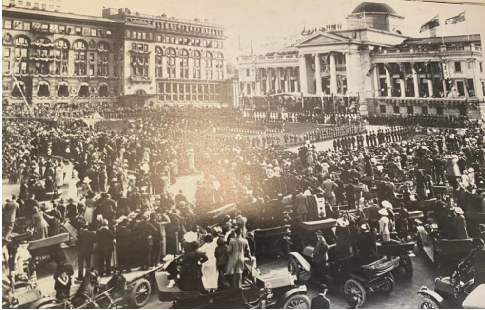
Fig. 7: The Reception Party for the Governor-General of Canada at the courtyard of the law building, 1912, photograph, Vancouver, B.C. (Fairley, The Way We Were , A-26).