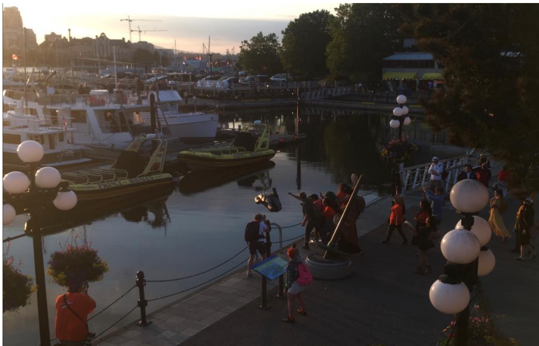
Fig. 10: The statue of Capt. James Cook being drown in the harbour of Victoria, B.C., July 2, 2021, photograph, Victoria, B.C., twitter by Climate Justice Victoria.

< https://twitter.com/CJusticeVic/status/1410808100127338497?ref_src=twsrc%5Etfw%7Ctwcamp%5Etweetembed%7Ctwterm%5E1410808100127338497%7Ctwgr%5E%7Ctwcon%5Es1_&ref_url=https%3A%2F%2Fvancouverisland.ctvnews.ca%2Fvictoria-statue-of-captain-cook-pulled-down-thrown-into-harbour-1.5494067 >