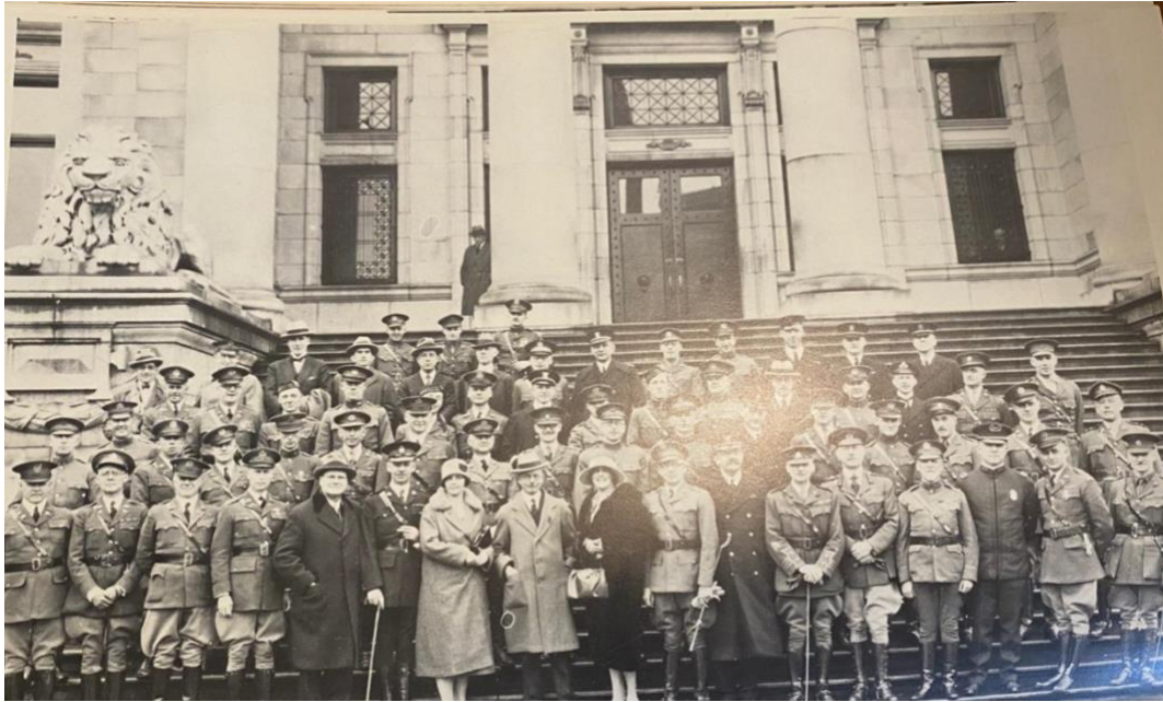
Fig. 9: The Military Institute with guests from the United States at the courthouse steps, 1926, photograph, Vancouver, B.C. (Fairley, The Way We Were , A-30).