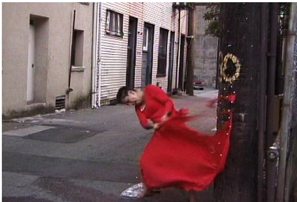
Fig. 4: Rebecca Belmore, an excerpt from the Vigil , 2002, performance, Vancouver, B.C., Rebecca Belmore's website, < https://www.rebeccabelmore.com/vigil/ >