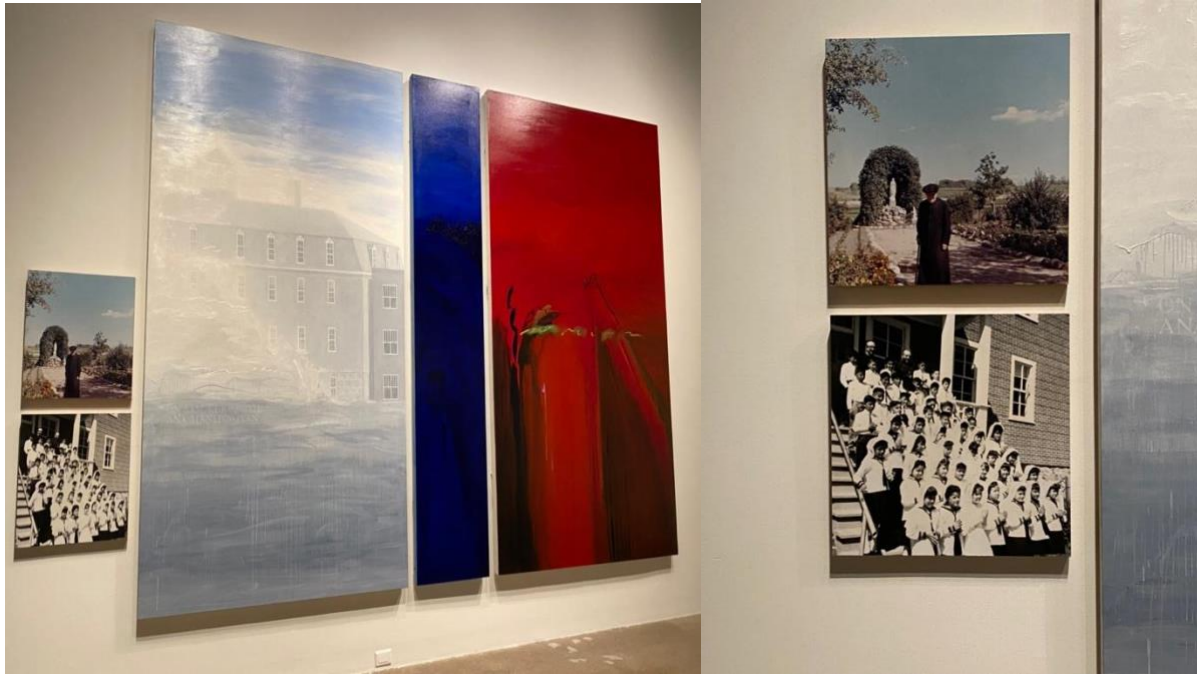
Fig. 5: Robert Houle, Sandy Bay , 1998-99, oil, black-and-white photograph, colour photograph on canvas, and Masonite, Art Gallery of Ontario, Ontario.