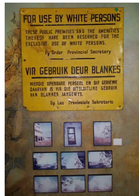
Apartheid Era sign South Africa