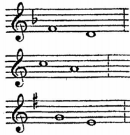
RELATIVE KEYS Relative majors and minors are always a minor third apart