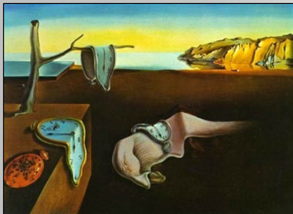
The Persistence of Memory Salvador Dali 1931 Museum of Modern Art New York City