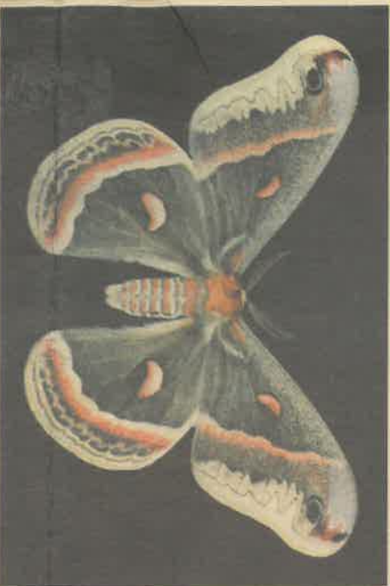
This Cecropia Moth was collected in Crosby, Ontario.