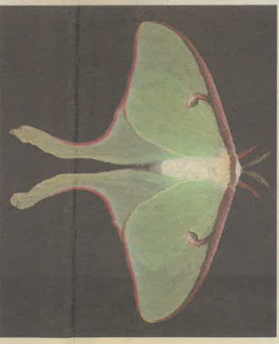
This Luna Moth was collected at Lac Bonin, Quebec.

Find more of Jim des Rivières' photos of moths online at ottawacitizen.com