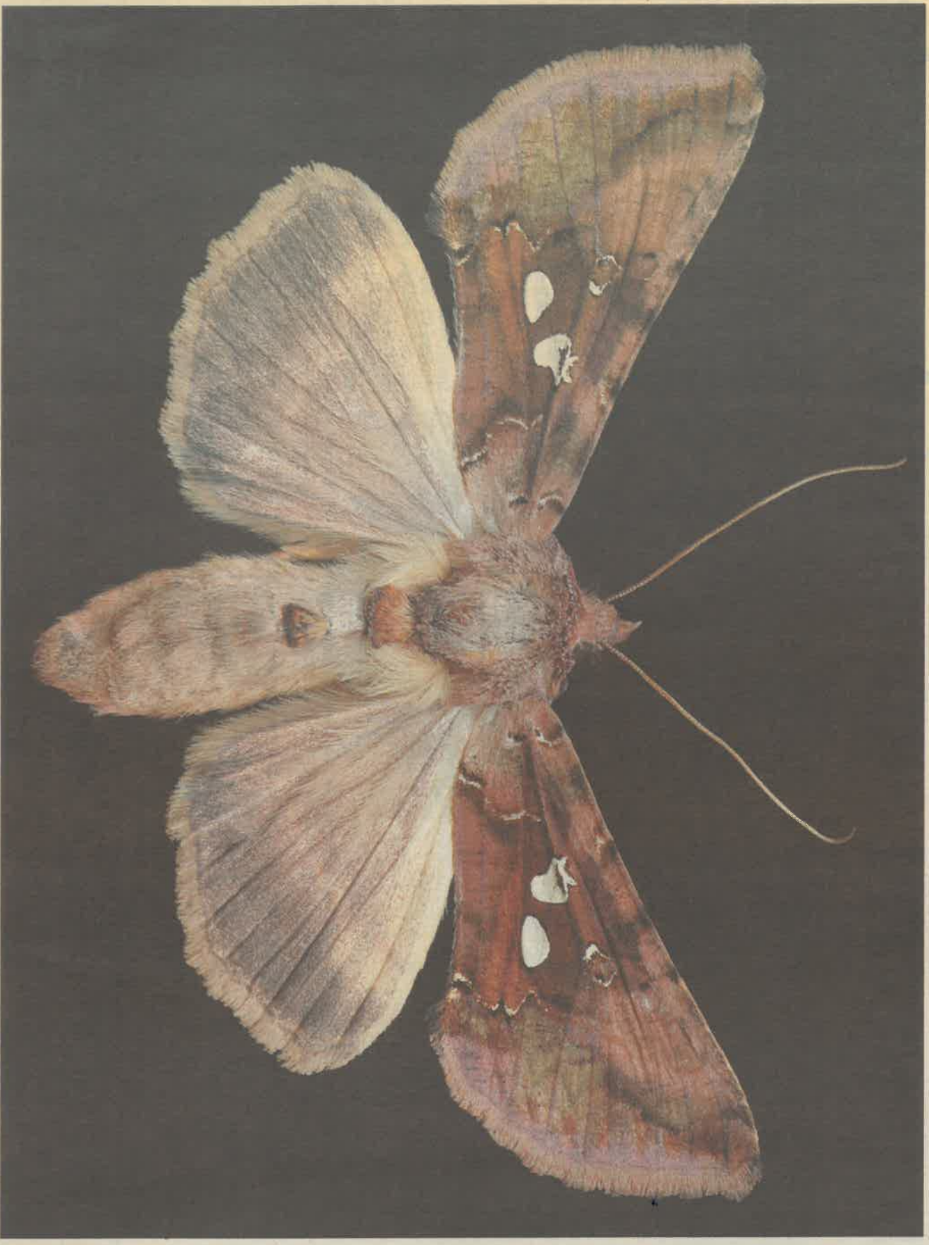
One of Jim des Rivières's favourite moths, the two-spotted looper, above, looks from a distance like a tiny brown moth with spots, but a closeup look reveals a delicate, colourful beauty.

They seem like the 'poor cousins' of butterflies. Yet moths are more numerous and equally as beautiful, says photographer Jim des Rivières. A new show at the Museum of Nature sets out to prove his point — on a mammoth scale.