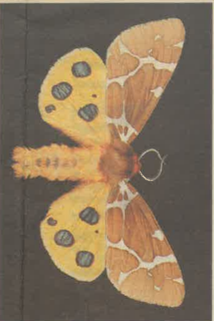
This Great Tiger Moth was found at Camp Fortune, Quebec.