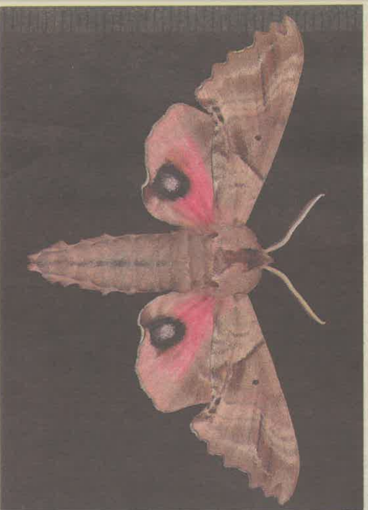
This Blinded Sphinx Moth was collected at Lac Bonin, Quebec.

Find more of Jim des Rivières' photos of moths online at ottawacitizen.com