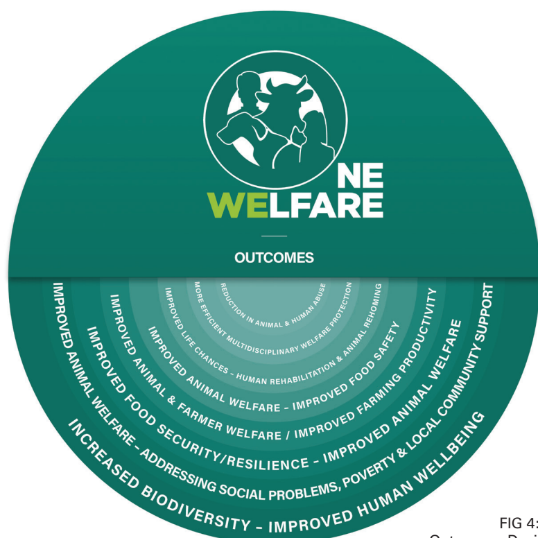
FIG 4: One Welfare Outcomes.