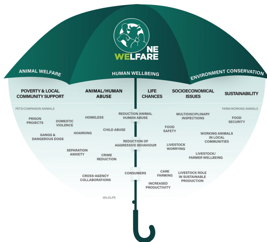
FIG 5: A One Welfare approach helps to identify and recognise the links that exist between different sectors. Design by R. Held

including concerns for animal welfare, which have to be considered alongside environmental sustainability and secure access to food (FAO 2008).