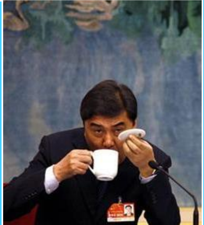
Xingjiang CCP Secretary Zhang Chunxian