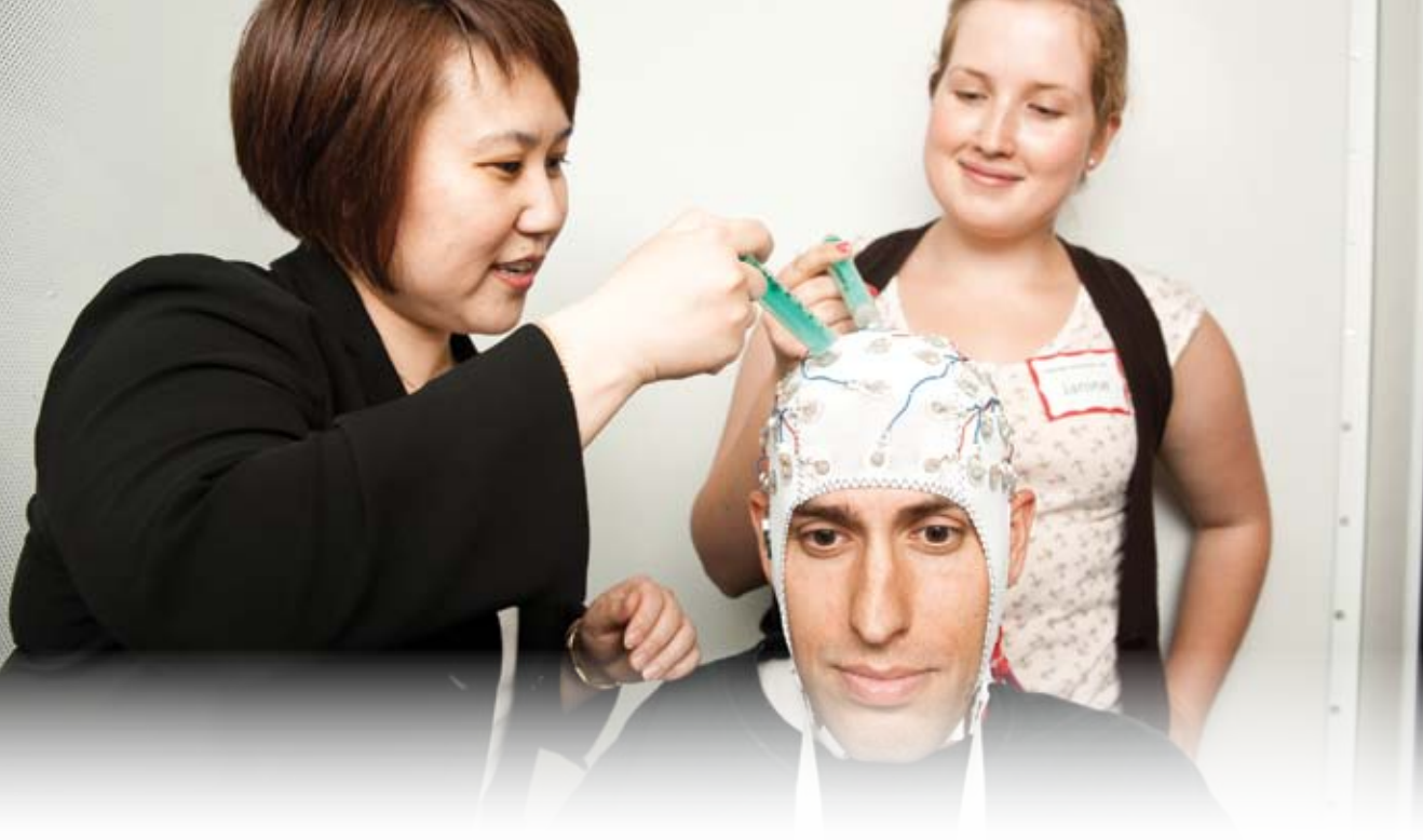
If you are interested in how people, animals or computers think, then join us in Cognitive Science and learn how to study the mind and the brain.

Cognitive science involves the study of cognition, perception, and emotion from perspectives that include the exploration of abstract concepts, detailed empirical research on language and cognition, the study of brain mechanisms, and computer modelling. Despite the many different methodologies they use, cognitive scientists are united in their interest in the mind—and the brain.