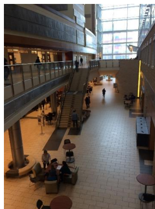
The Katz Atrium, University of Alberta.

The 101st Canadian Chemistry Conference and Exhibition will be held in Edmonton, from May 27-31, 2018: http://www.csc2018.ca/ .