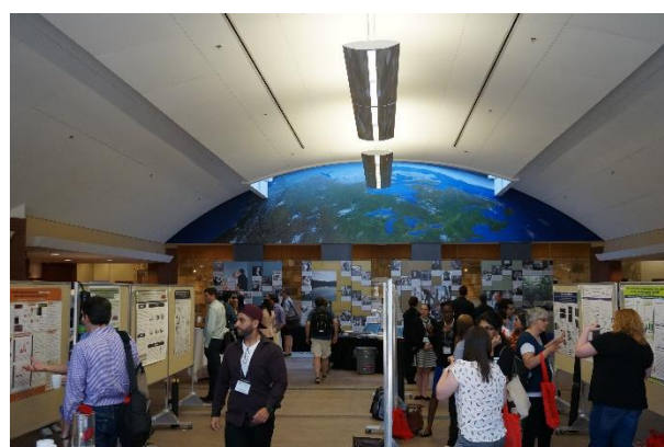
Students discuss their posters