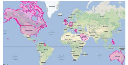
Honduras, Barbados, Australia, UK, Guyana, Germany, Philippines, Greece, and Saudi Arabia

From Australia to Saudi Arabia, Carleton's distance students are tuning in to their classes through CUOL. Check out all the countries they come from!