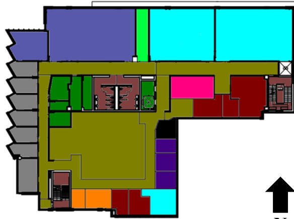
Figure 3. Example floor plan of zone groups indicated by different colors, zones from multiple floors may belong to the same group due to similar thermal behaviors

Table 3 compares the simulation results between the original model and reduced model. The differences in the energy consumption between the original model and the reduced model are relatively small considering the magnitude of model complexity reduction from the original model. There is a large discrepancy for the fan energy consumption, though and may be caused by the fact that only floor area is used to calculate the zone multiplier, not zone volume. The difference between the equipment loads is also quite larger, but this can be caused by the fact that another casual heat gain source, lighting load, is much higher than the equipment loads, so the characteristics of equipment usage are not well represented by the loading factors.