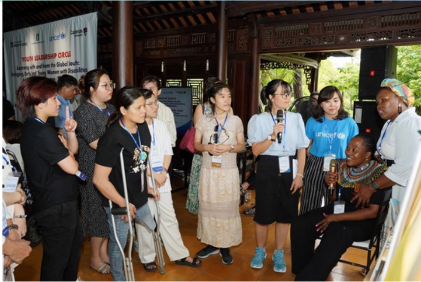
Photo 6: Young women with disabilities from South Africa presented their collages at ENGAGE's Youth Leadership Circle in 2023.

In early 2023, the participants elected as leaders and representatives at each of the project sites came together to form the Youth Leadership Circle. Initially, 2 – 3 girls and young women from each location met online using the Zoom platform, with the support of the local research assistants or their teachers, to get to know one another and begin their collaboration. Three online meetings were held prior to the in-person international workshop in Hue, Vietnam in June 2023, providing participants with opportunities to connect, share their experiences and perspectives, and work together to actively shape the agenda for the forthcoming event.