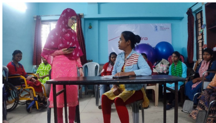
Photo 2: The rehearsal in preparation for the final performance on the International Day of Persons with Disabilities.

Starting October 3, 2023, 4 girls and 12 women with disabilities participated in our second workshop of the year in India. This three-day workshop was dedicated to creating a play to be performed on the International Day of Persons with Disabilities (December 3). During the workshop, the participants played several theatre games to facilitate coordination and to learn to role-play as a medium of activism, and they also wrote a script for the play. In addition, they shared their learning experiences from the Youth Leadership Circle event and devised ideas through which they could continue to build a network of girls and young women with disabilities in their villages in the district of South 24 Parganas, West Bengal, India.