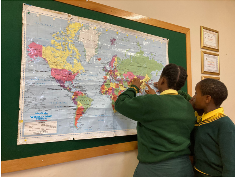
Photo 1: Girls with disabilities identifying South Africa, India, and Vietnam on the world map.

In 2023, I had an opportunity to engage with our local research teams and participants from the three different sites of the project. My trip to South Africa in February 2023 provided me with some important learning and insight about the challenges and opportunities that our partners and participants are facing in a “post”-pandemic context. More importantly, it was also an opportunity to learn about the deep roots of social inequalities which young people, including women and girls with disabilities, face in this global neoliberal time and space, through such forms as “load-shedding,” resource scarcity, and the challenges of transitioning from school to work. And yet, our South African partner’s deep commitment and interest in the project reminds us that, as my colleague from Blind South Africa shared, there is immense hope and optimism that the ENGAGE project may foster social change in such spaces. And, while not everyone involved was able to fully engage in this space in an equal manner (due to competing needs and responsibilities), the participants’ hopes and desire for change set them up for action. Perhaps the “decolonial” knowledge and praxis which the ENGAGE project has attempted to foster have simply started from there – from and across cultural spaces in the Global South.