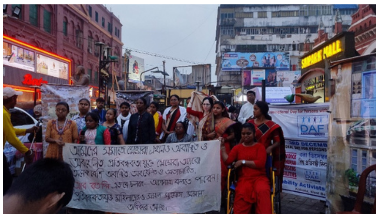
Photo 3: The participants at the end of the performance, conveying the message that disabled women and girls have equal rights.

Then, the participants from the ENGAGE Project presented their street play named “Aar Koto din?” (For How Long?) during the awareness programme organized by Disability Activists Forum West Bengal (DAFWB) in a busy market in Kolkata on the International Day of Persons with Disabilities (December 3, 2023). With a diverse audience and several disability activists present, this play, developed and presented by 13 girls and women with disabilities, aimed to convey the message that sex determination of fetuses for killing the female fetuses before birth is a crime. The session also emphasized the role of education in creating opportunities for progress and growth for disabled women.