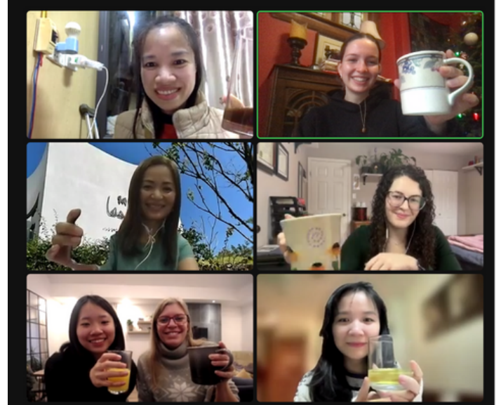
Photo 11: A screenshot of our virtual year-end party for ENGAGE Carleton staff and research assistants.