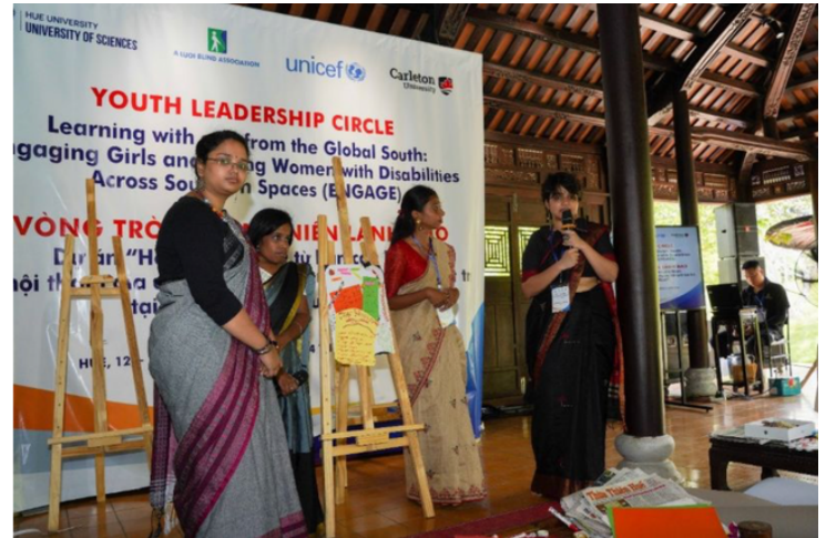
Photo 7: Young women with disabilities from India presented their manifesto at ENGAGE's Youth Leadership Circle in 2023.

The event also featured talks delivered by disability activists and advocates, and the opportunity for participants to build their activist agendas through the development of a Disabled Girls' Manifesto. During this final activity, participants created a declaration in the form of a short video or a written statement, which they then shared with others.