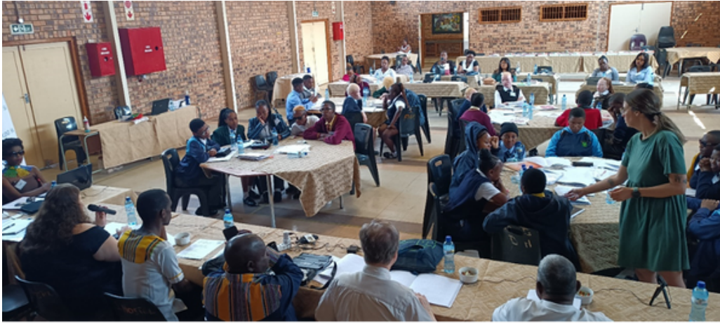
Photo 12: Visually impaired youth at the National Youth Parliament.

History unfolded when Blind SA commenced the first-ever National Youth Parliament on 23 September 2023 in South Africa. 14 schools from 7 provinces came together to robustly debate issues that affect the lives of visually impaired youth, socially, politically, academically, and otherwise.