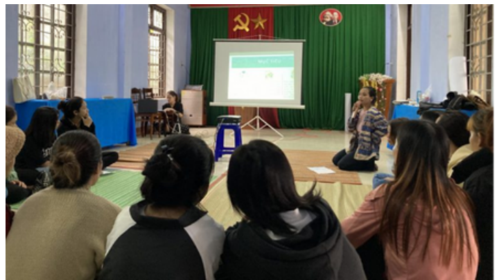
Photo 5: A youth leader presenting her learning experiences from the YLC to the rest of the participants from Vietnam.