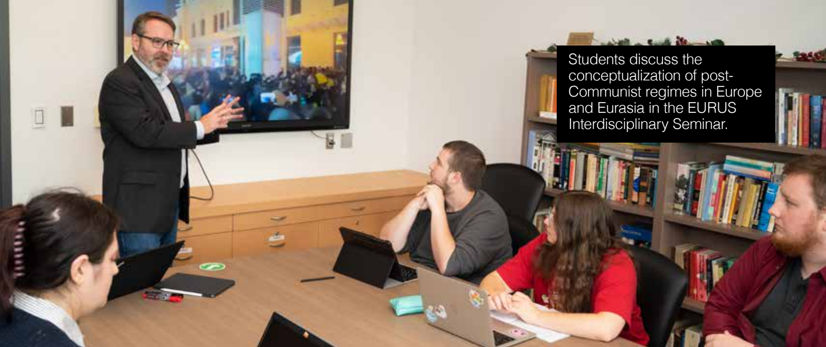
Students discuss the conceptualization of post-Communist regimes in Europe and Eurasia in the EURUS Interdisciplinary Seminar.