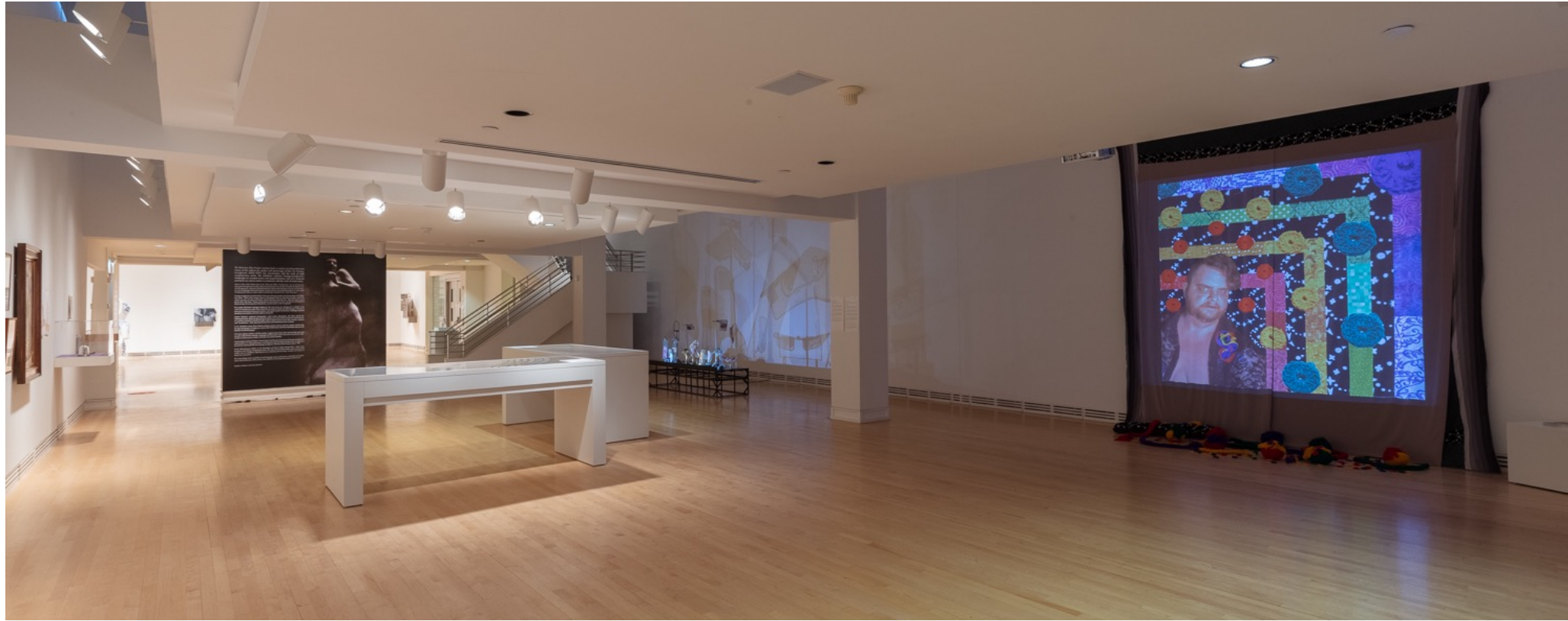
Installation view of The Baroness Elsa Project.