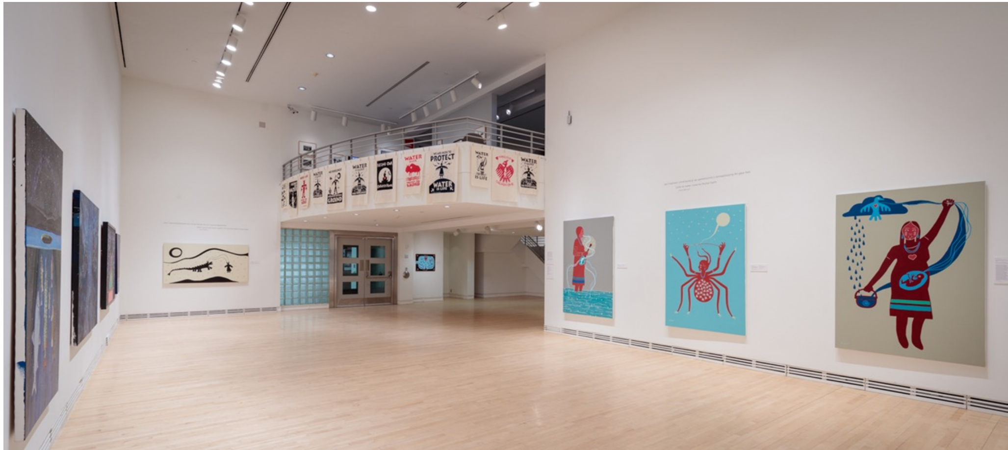
Installation view of UPRISING: The Power of Mother Earth – a Retrospective of Christi Belcourt with Isaac Murdoch.