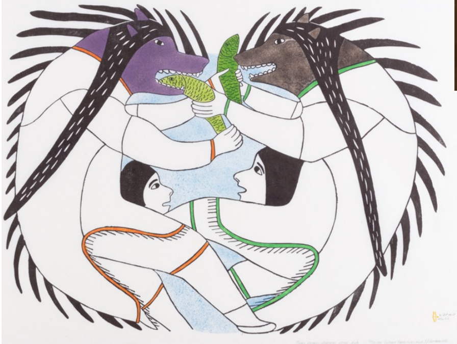
Victoria Mamnguqsualuk, Bear People Sharing Some Fish 1981

Selection of slides from Art and wellness workshop (held on Zoom)