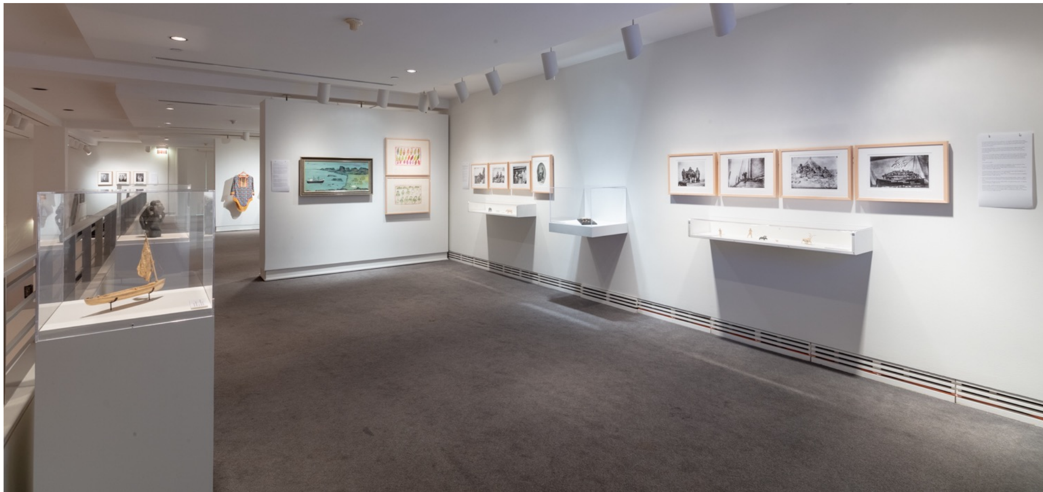
Installation view of Nuvisi: Threading our Beads at Qatiktalik.