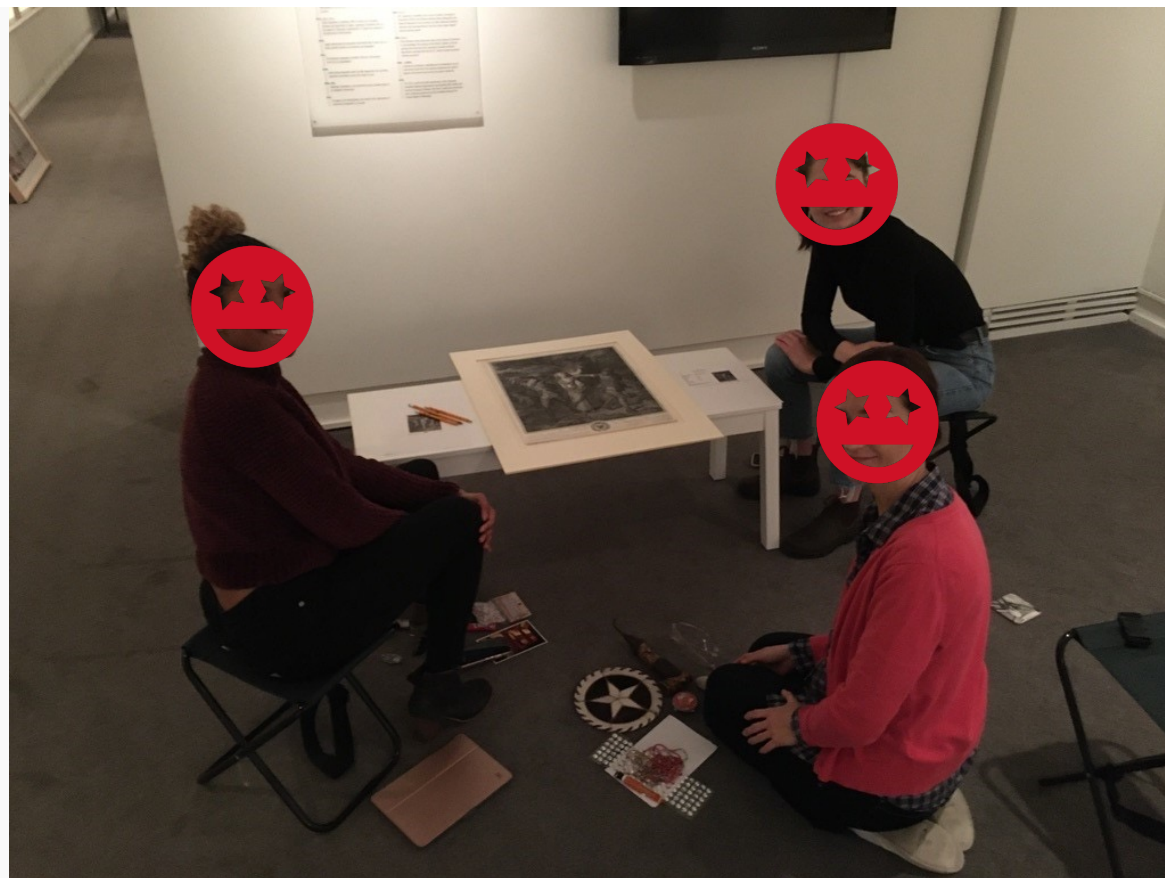
Storybuilding workshop, Winter 2020.