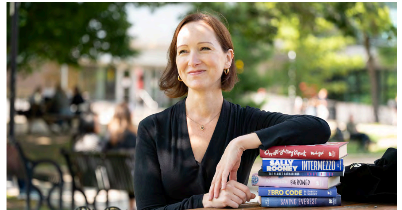
Brouillette's research explores how digital platforms such as Wattpad are reshaping writing, publishing, and creative labour.

Brouillette says even audiobook production is being reshaped by the demands of platform listening.