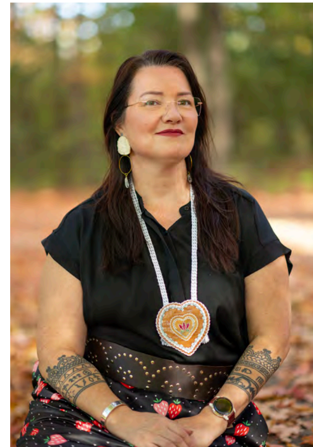
Immersive storytelling technologies used in Horn-Miller’s research invite participants into Indigenous stories in multi-sensory ways.

natural world and shape a different kind of academic practice, one rooted in responsibility, reciprocity, and resonance.