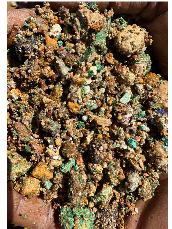
A mix of copper and cobalt along with other minerals. Often when the minerals are sold, other minerals are not paid for, leading Congo to lose lots of profit.

“It is not all about violence. It is not all about resources. We are humans too. We have stories to tell.”