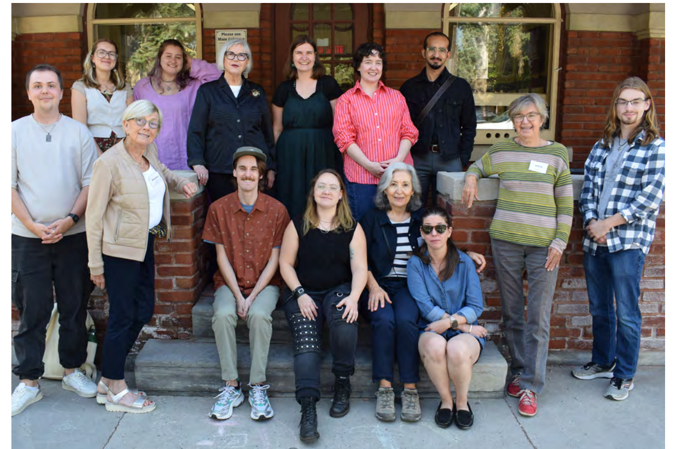
Researchers, students, and collaborators of StudioDH, Carleton's community-engaged digital humanities research hub.