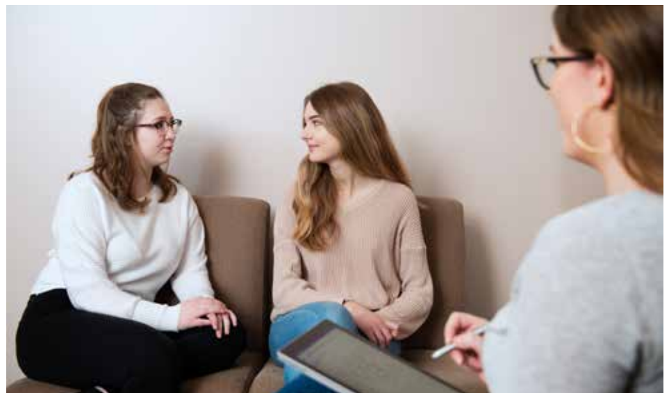
Social Work students conduct a mock counselling session in the School of Social Work's observation room. Through a one-way mirror, other students can watch and learn from the counselling session.

BSW graduates are also eligible for the one-year Master of Social Work program.