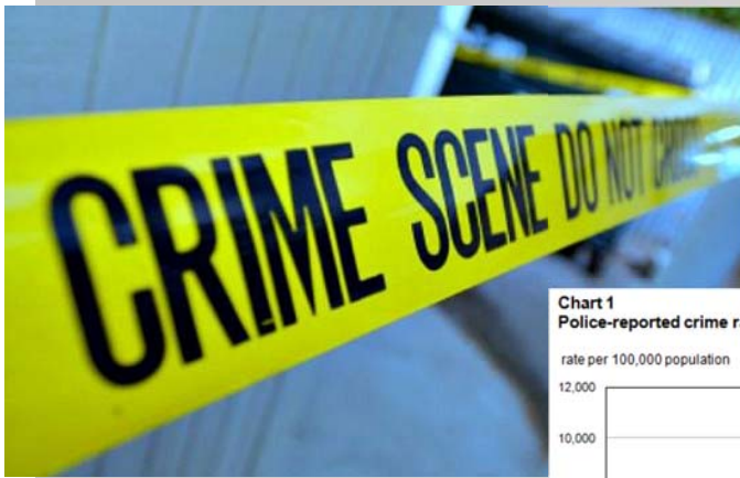
Chart 1 Police-reported crime rate, Canada, 1962 to 2013