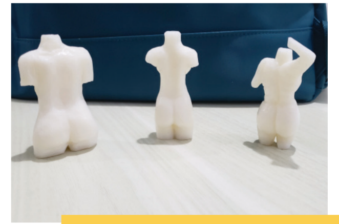
Soap modelling results during team training for modelling workshop.

This study qualitatively analyzes the individual and social well-being of female breast cancer survivors who underwent mastectomies in Pernambuco, Brazil. This study focuses on the potential of design as a vehicle for the resignification of self-image by women who have undergone mastectomies due to breast cancer, and to aid in reducing negative perceptions about their bodies. Through interviews, workshops, and exhibitions in collaboration with The Support and Self-Awareness Group for People with Cancer, this study has collected diverse personal experiences from survivors of breast cancer and of those receiving treatments, has highlighted the demands during the different stages of cancer treatment, has provided insight on the relationship these women establish with their own bodies and with artifacts they use, and has allowed women to explore strategies to rebuild their self-image and break taboos related to breasts and breast cancer.