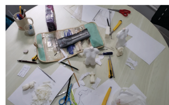
1. Virtual exploratory research done prior to conducting the workshops. 2. Modelling training workshop for the team using soap to create models.