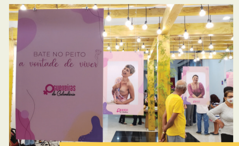
1. Digital booklet created to assist participants with the virtual meeting platforms so that they can participate in the meetings and workshops. 2. "Guerreiras do Calendario" (Calendar Warriors) exhibition.