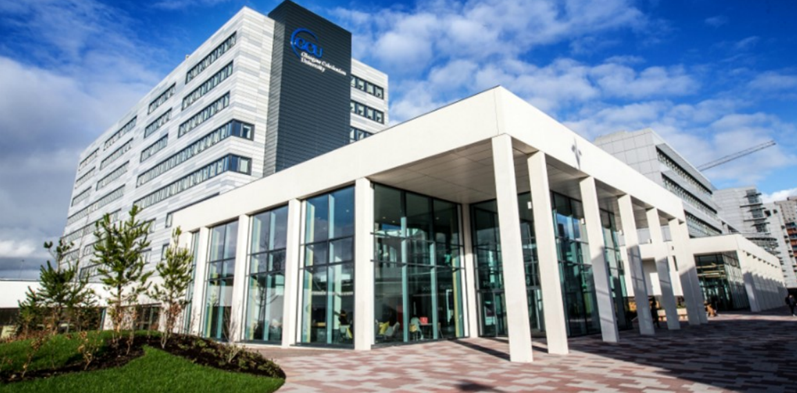
GCU Campus – Annie Lennox Building