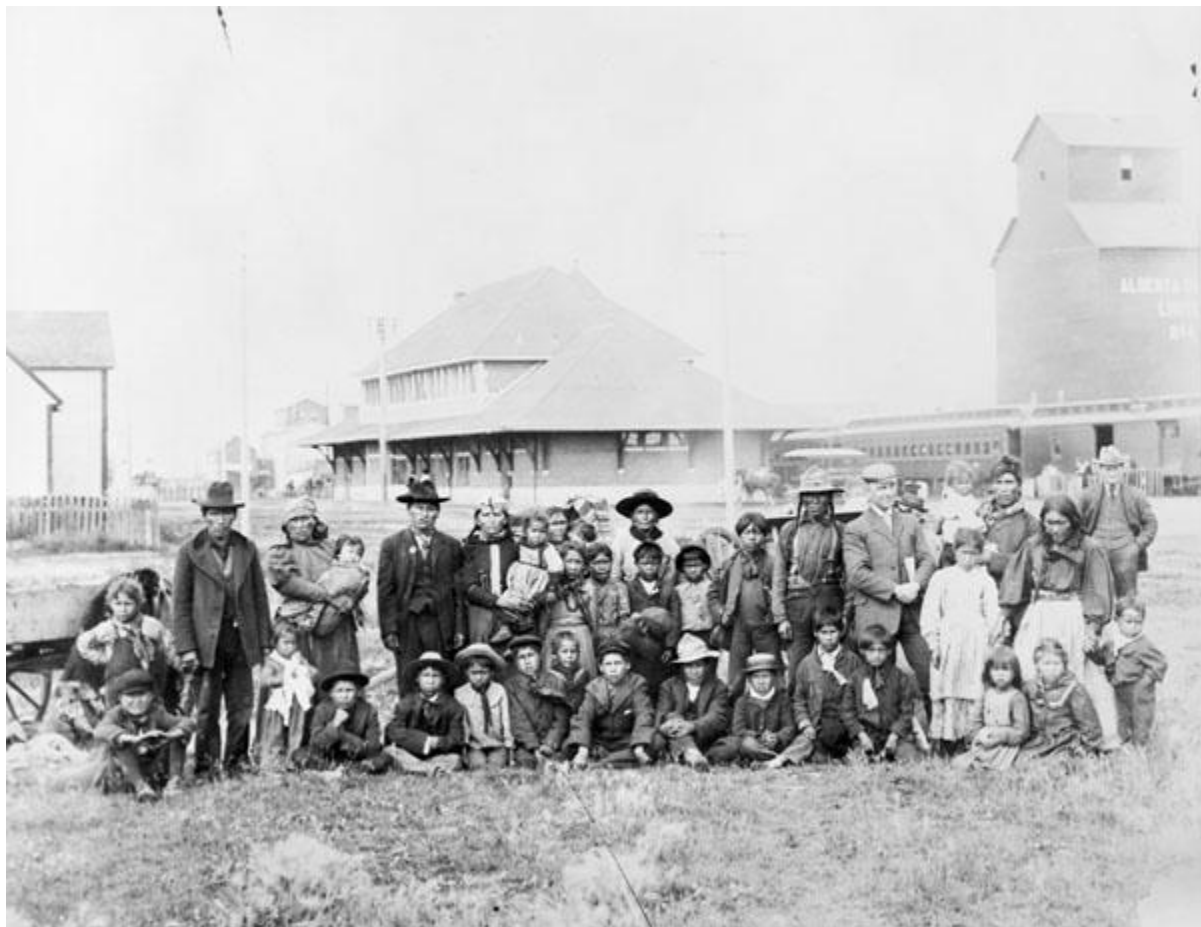
3194036 (Item no. A-13-1-11, box 02632) A group of students and parents from the Saddle Lake Reserve (Alberta), en route to the Methodist-operated Red Deer Indian Industrial School, Alberta, date unknown