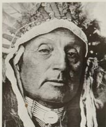
Nordamerikanische Indianer (Sioux)