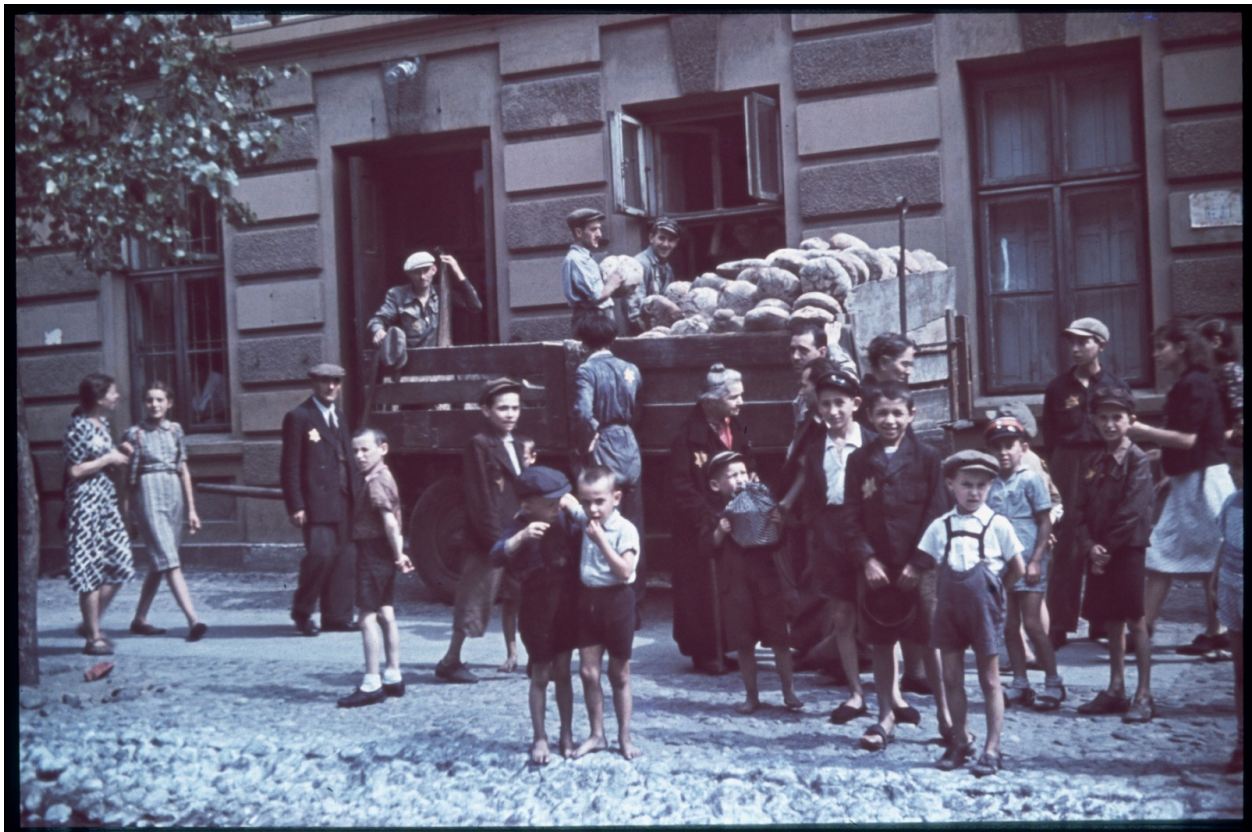
Children wait outside the bread distribution center in the Lodz ghetto.