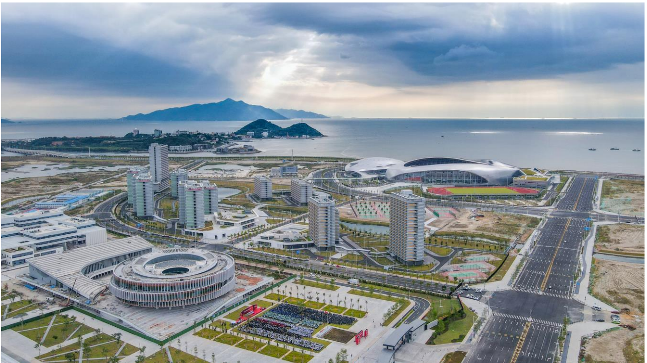
(East Coast Campus)

Shantou University is committed to offering student-centered education with the educational idea of “Building up Oneself for the Pursuit of One’s Selflessness”. It is engaged in reforms related to university governance and talent development, and also planning to relocate the Medical College into the main campus and to develop a globally advanced curriculum focusing on life science. Since 2001, the University has conducted a profound internationalization-oriented reform, and overseas talents have been recruited to serve as provost, vice president and deans. Through a series of reforms in curriculum design, teaching, resources management and human resources system, it aims to offer a platform for the exploration of higher educational reform in China. Shantou University is striving to be a top-tier university that provides quality education, develops advanced governance system, shows distinctive feature of internationalization, endeavors to meet the major demands for economic development of the nation and Guangdong, and places high value on innovation, creativity and entrepreneurship.