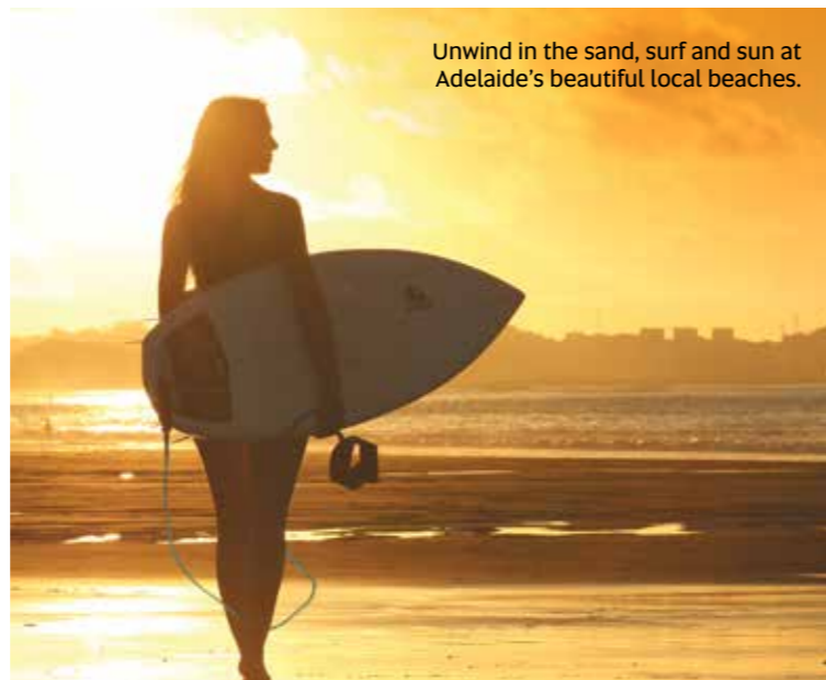
Unwind in the sand, surf and sun at Adelaide's beautiful local beaches.