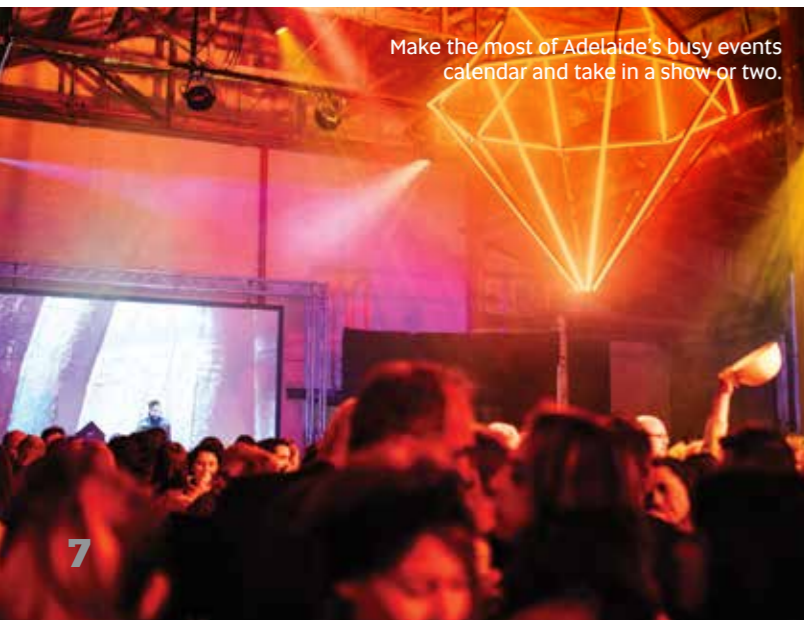
Make the most of Adelaide's busy events calendar and take in a show or two.

Adelaide offers an exciting range of multicultural food and is regarded as the food and wine capital of Australia with more restaurants per head than any other Australian city. So explore the city and enjoy the eating options around town, from fine dining to food trucks.