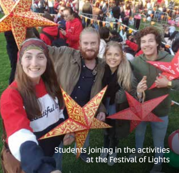
Students joining in the activities at the Festival of Lights