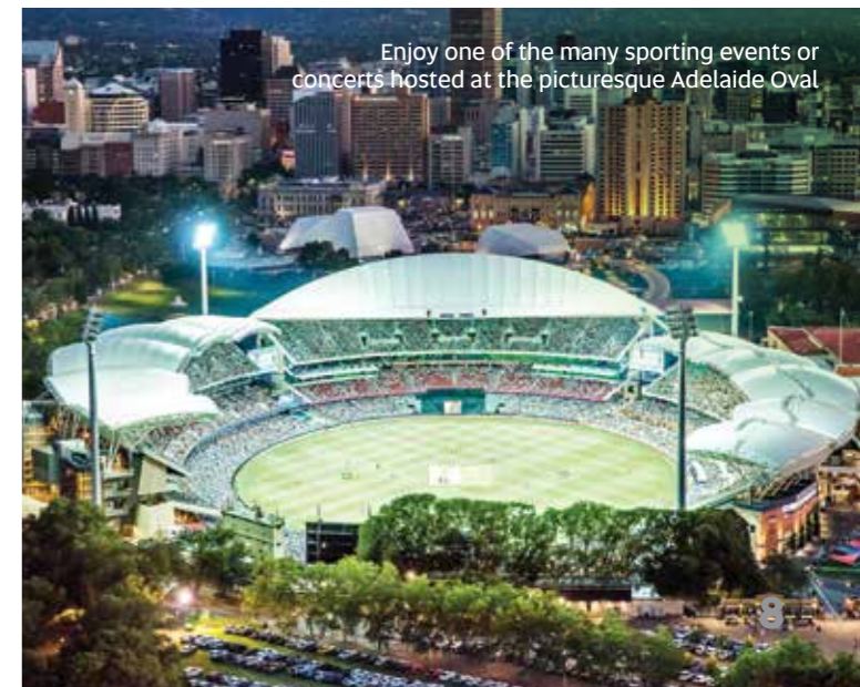
Enjoy one of the many sporting events or concerts hosted at the picturesque Adelaide Oval