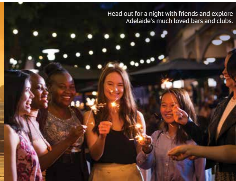
Head out for a night with friends and explore Adelaide's much loved bars and clubs.