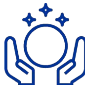
Reconciliation of values