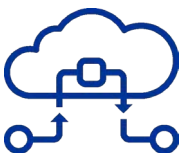
The techno-economic transition

The Centre analyses and develops innovative legal and policy instruments that can be used to govern the transitions, within the EU and in its external relations. Positioning ourselves at the interface of academia with political, legal and other societal decision-making, we focus in particular on the international and European governance of the environmental, economic and energy transitions and their interactions.