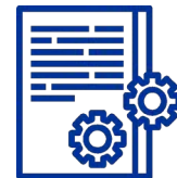
Innovative laws, policies and policy frameworks