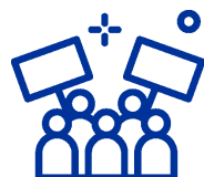
Democratic transition governance