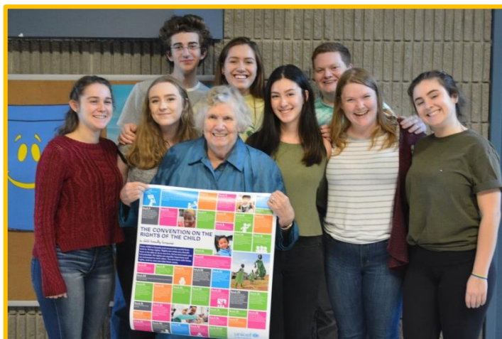
Hon. Landon Pearson O.C.

Since our children are going to inherit the world our individual and collective decisions have made for them they deserve to have a say in the process of reversing some of their worst impacts. Shaking the Movers workshops, which are youth-driven and youth led have been launched across the country to "shake" us "movers" up. The following report emerges from the first of these workshops to be held in New Brunswick. Being New Brunswick, it had some special characteristics. For one thing, it was bilingual and for another, the participants included refugee youth who know first hand the challenges of a changing world. After much discussion the young people offered ideas and suggestions that are authentic and creative and deserve the widest possible audience. It is our responsibility now as adult "movers" to honour these "shakers" by enabling all young people to make our world safer and healthier for their descendants than we have made it for them.