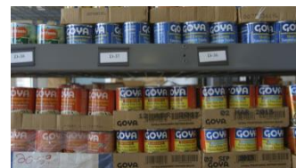
Image from The Prison in Twelve Landscapes (directed by Brett Story)

Students will read detailed accounts of imprisonment in North America, South America, and other areas of the world. These studies foreground the complex experiences of groups targeted by criminal law. We will begin with Indigenous and Black race-radical feminist auto-ethnographic approaches to the theorization of criminal justice systems (or the carceral state). This framing will orient the remainder of our inquiry. Key topics will include: The political economy of punishment and resistance;