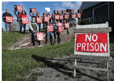
Ottawa Citizen : Local residents opposed to the plan to build the Greater Ottawa Correctional Complex in Kemptville gathered at the proposed location in early October.