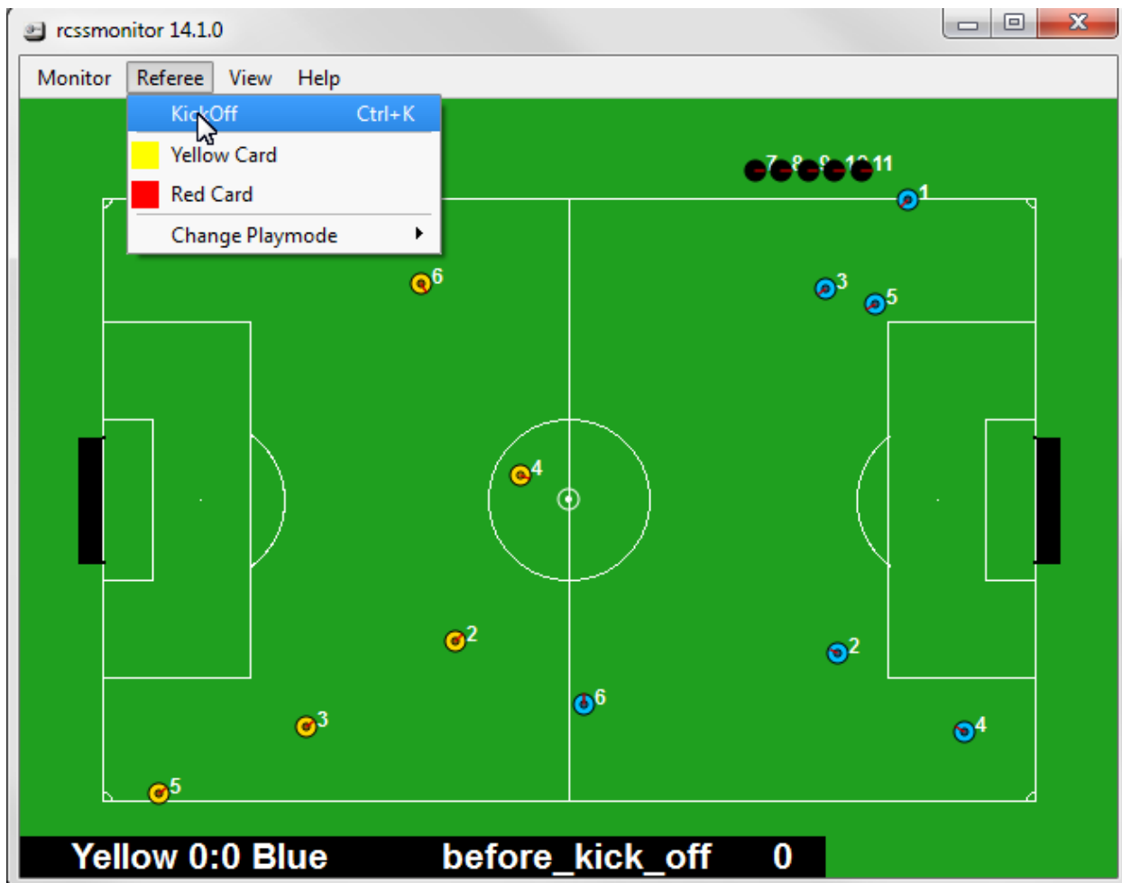
Figure 2: The KickOff menu item