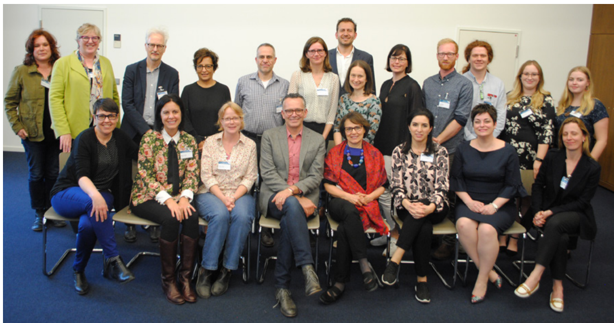
April 2018, SAR Canada meeting