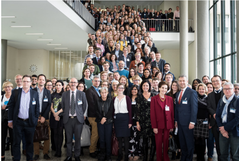
April 2018, SAR Global Congress