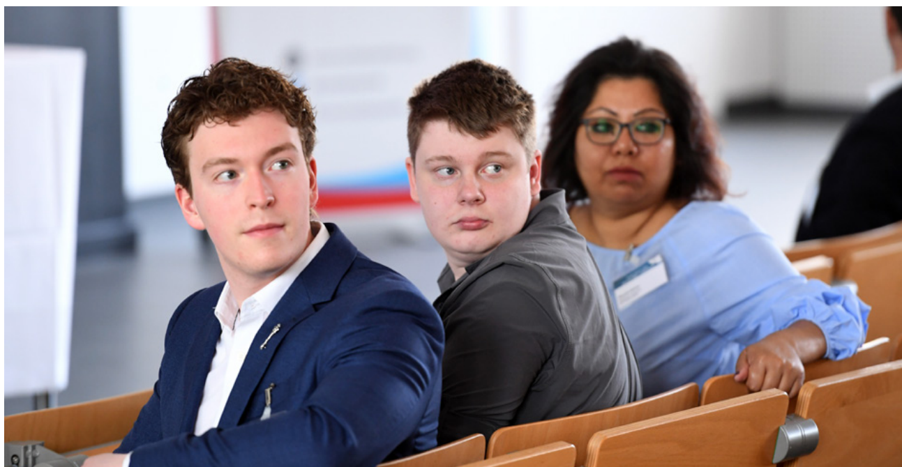
April 2018, SAR Global Congress