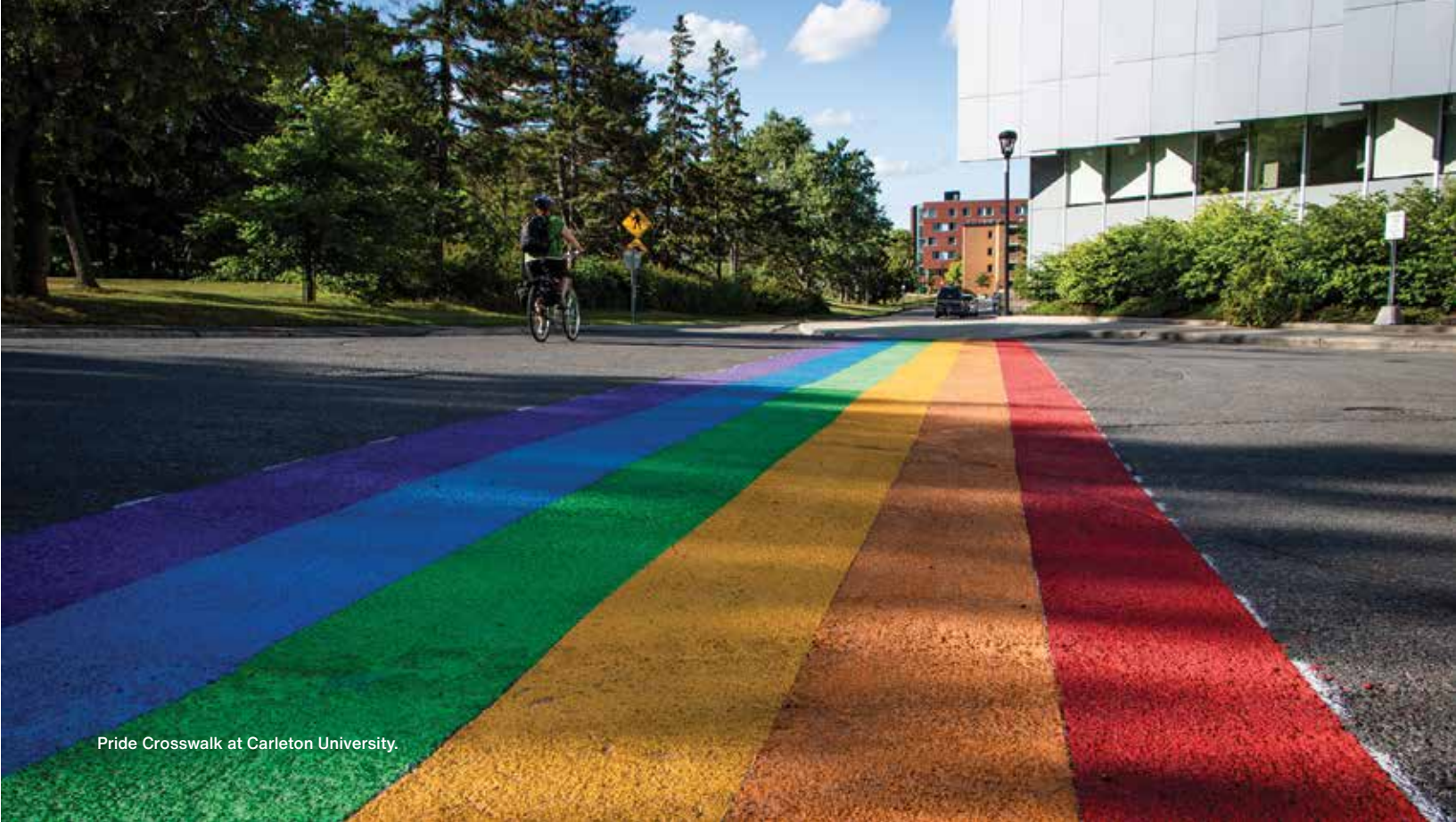
Pride Crosswalk at Carleton University.