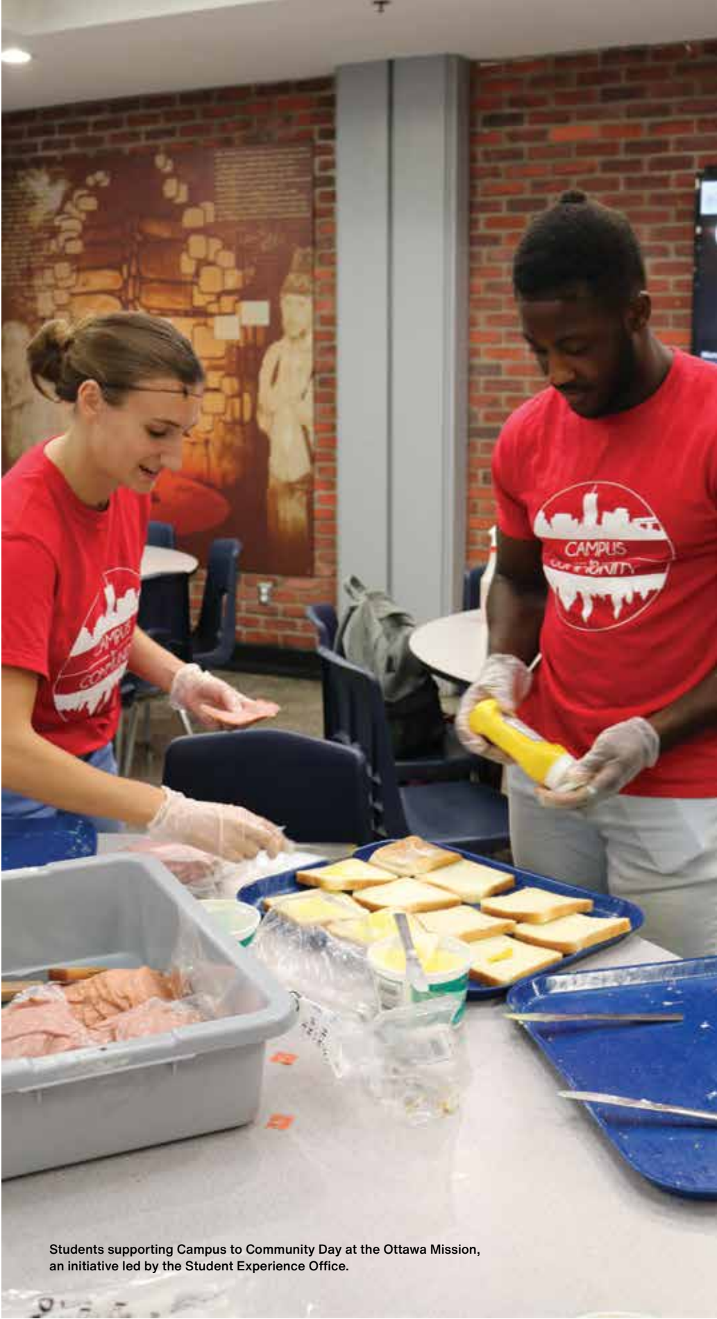
Students supporting Campus to Community Day at the Ottawa Mission, an initiative led by the Student Experience Office.

This is a dynamic plan — what we present here today is a roadmap for the next two years, while leaving space for what will naturally evolve over the years to come. Many great initiatives are already taking place, and we herein provide more intentional and strategic approaches towards advancing our commitment to community engagement.