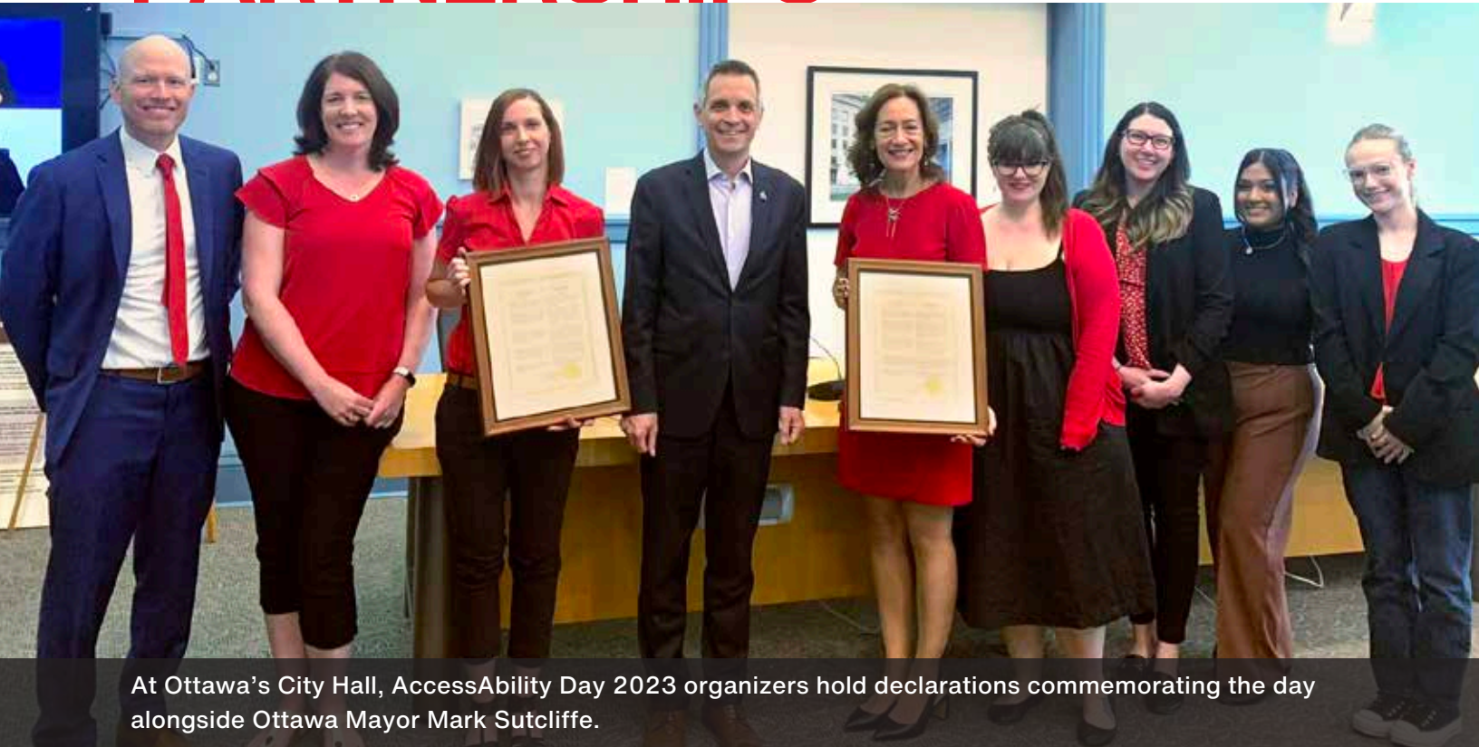
At Ottawa's City Hall, AccessAbility Day 2023 organizers hold declarations commemorating the day alongside Ottawa Mayor Mark Sutcliffe.