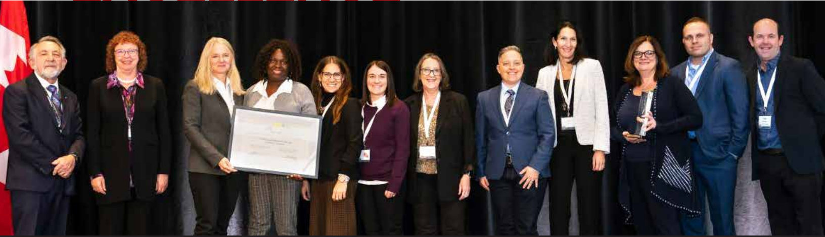
Students and Enrolment received the 2023 Organizational Excellence Gold Award at the Canada Awards for Excellence in November.