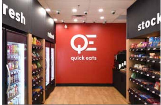
Dining Services opened up a 24/7 AI-powered autonomous store called Quick Eats for round-the-clock dining.