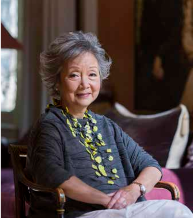
The 10 th Annual SOAR Student Leadership Conference keynote speaker, the Right Honourable Adrienne Clarkson.

• The Office of Student Affairs' harm reduction outreach efforts reached over 1,300 students this year, with notable events including the Panda Party Safe Fair, National Addictions Awareness Week and St. Patrick's Party Safe Fair. In partnership with NaloxoneCare, the office also offered 11 naloxone training sessions with over 600 registrants and supported the distribution of over 400 kits to Carleton community members. Furthermore, there are now 19 emergency naloxone boxes across campus.