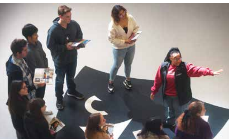
Our new promotional video tells our story through six short vignettes highlighting a small amount of the incredible work happening across our division every day.