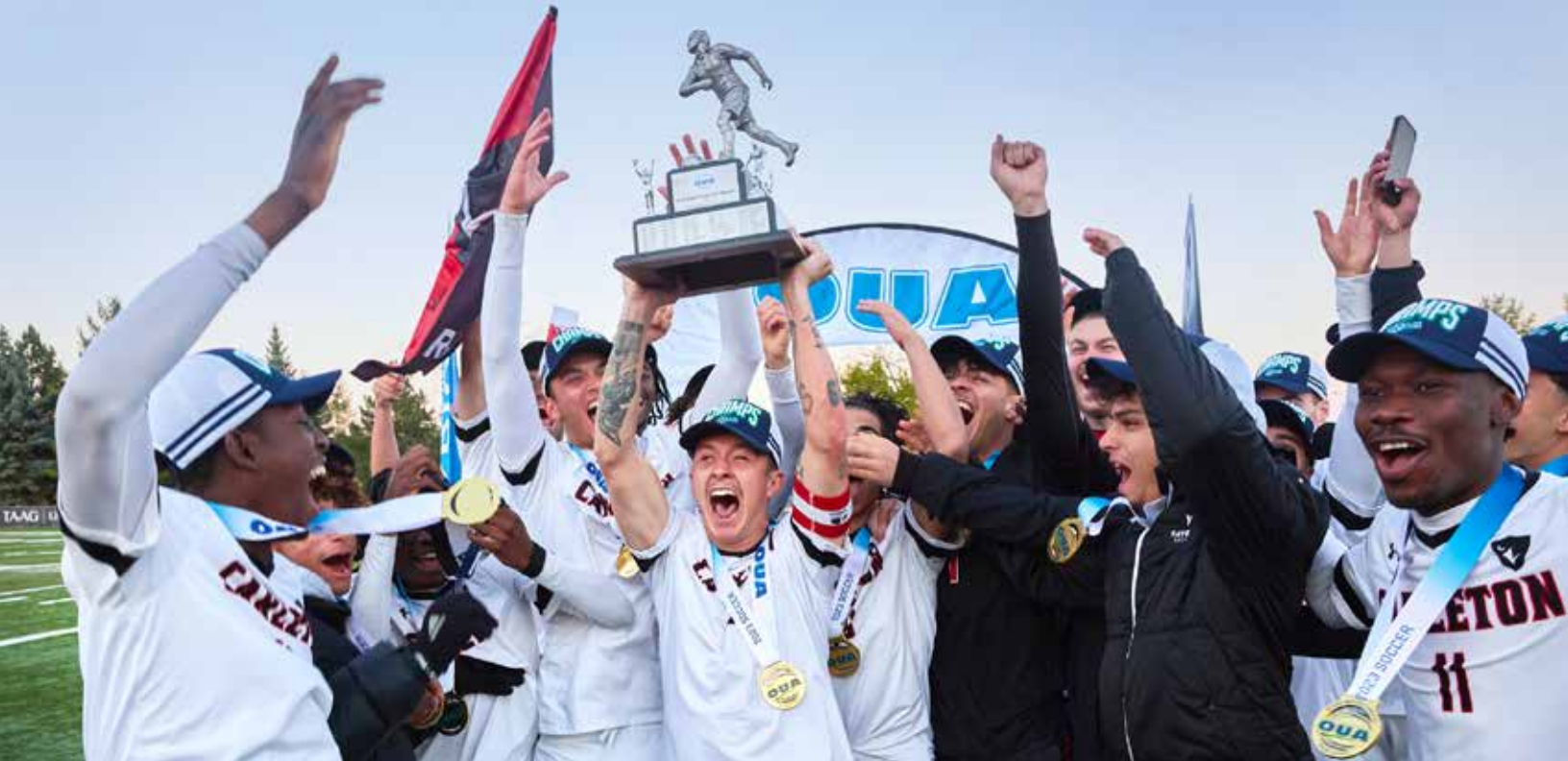
The Ravens men's soccer team won the 2023 Ontario University Athletics Championship.