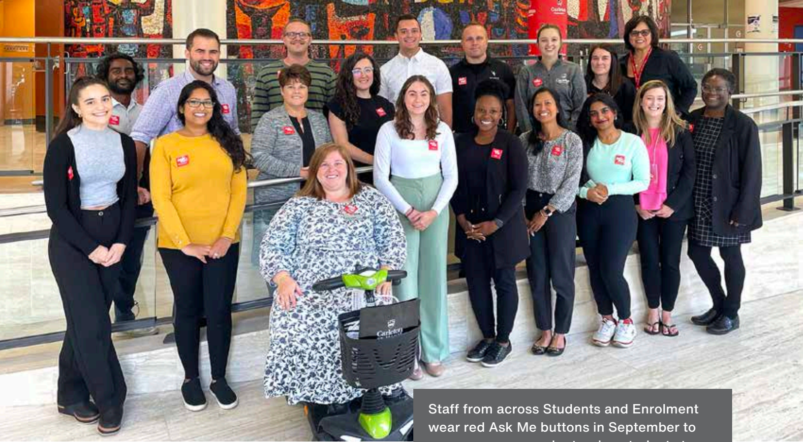
Staff from across Students and Enrolment wear red Ask Me buttons in September to encourage new and returning students to ask any questions they may have.