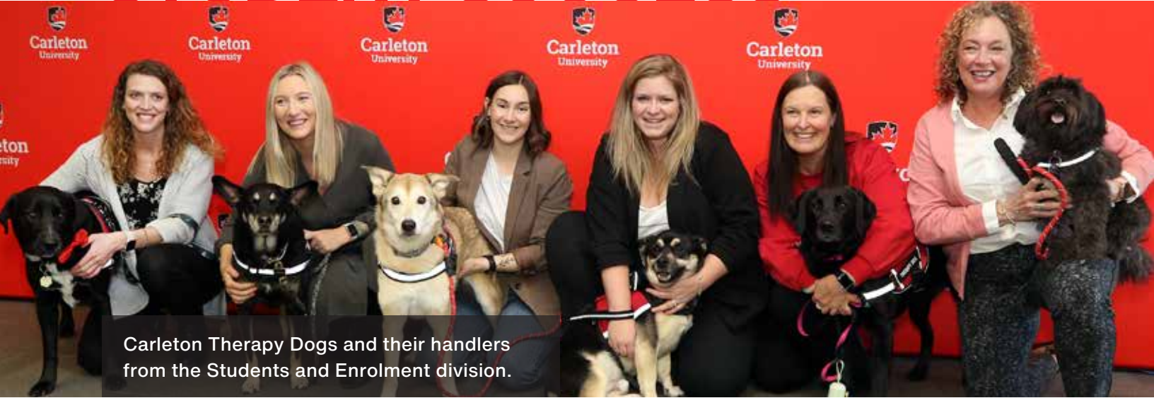
Carleton Therapy Dogs and their handlers from the Students and Enrolment division.