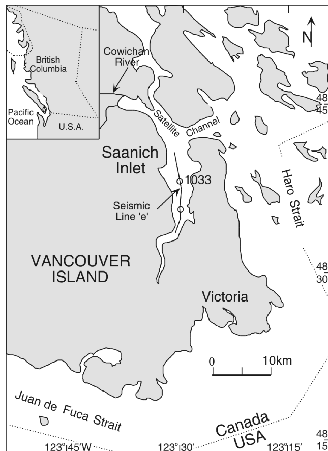
Fig. 1. Map of Saanich Inlet showing location of ODP site 1033 (modified after Patterson and Kumar, 2002).

Twelve cores (1H to 12H) of varying length were taken at ODP Site 1033 (Hole 1033B) in 238 m of water in the southern narrower part of the inlet (Fig. 1). Each core was partitioned into 1.5 m sections and numbered from the top. The lowermost